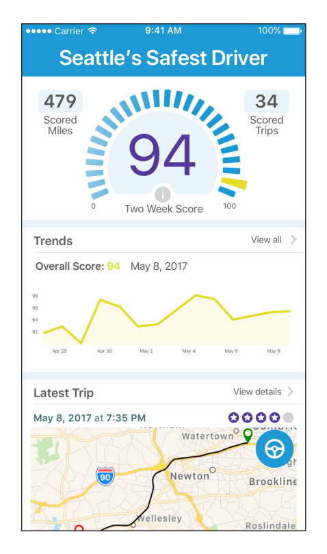
Dashboard – where you'll see your overall score and a summary of your latest trip