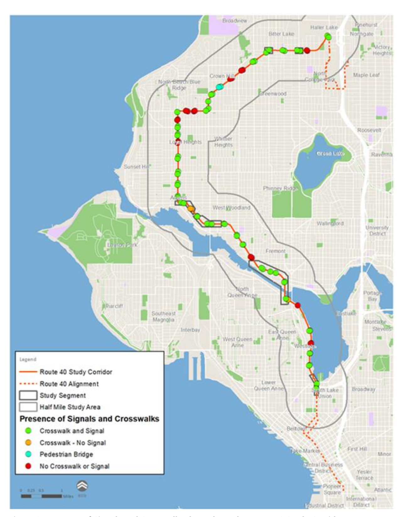
Figure 3: Presence of Signals and Crosswalks throughout the Route 40 Study Corridor