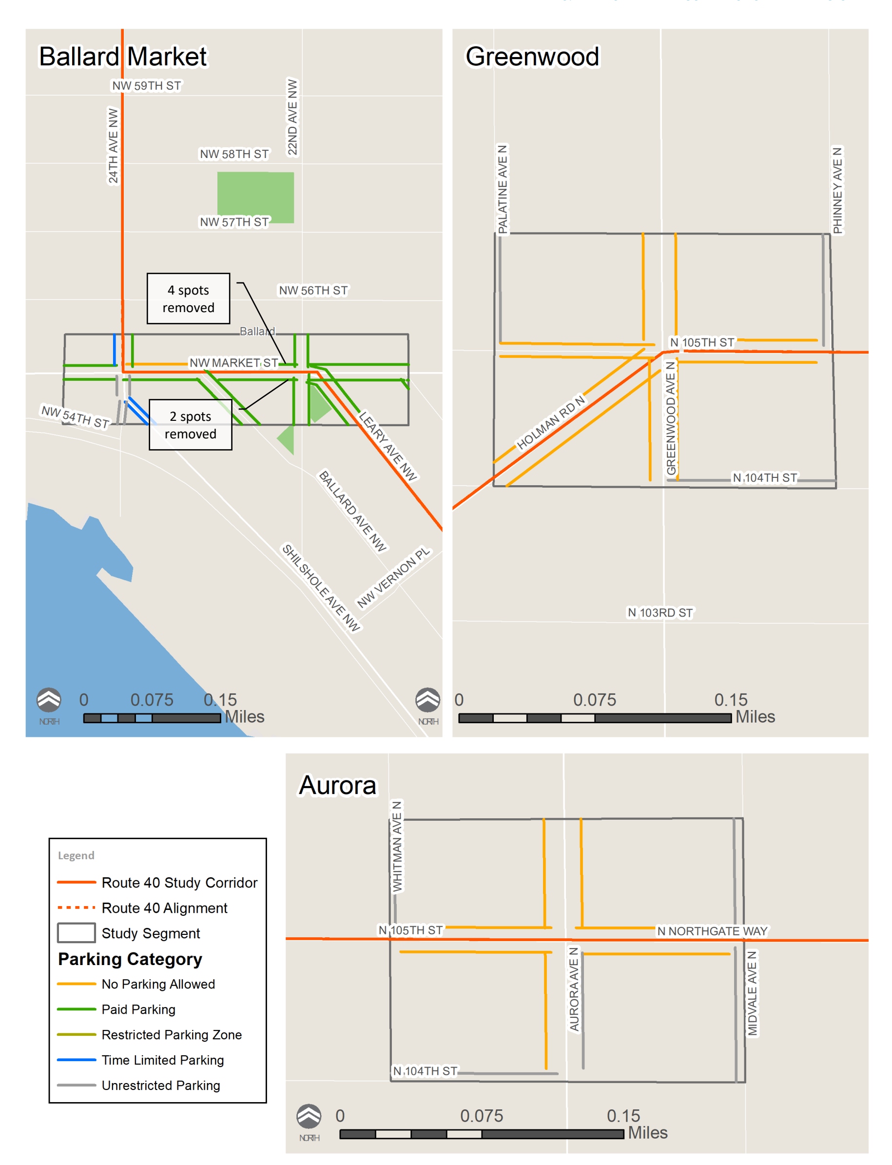
Figure 7: Parking Categories for Ballard/Market, Greenwood, and Aurora Segments