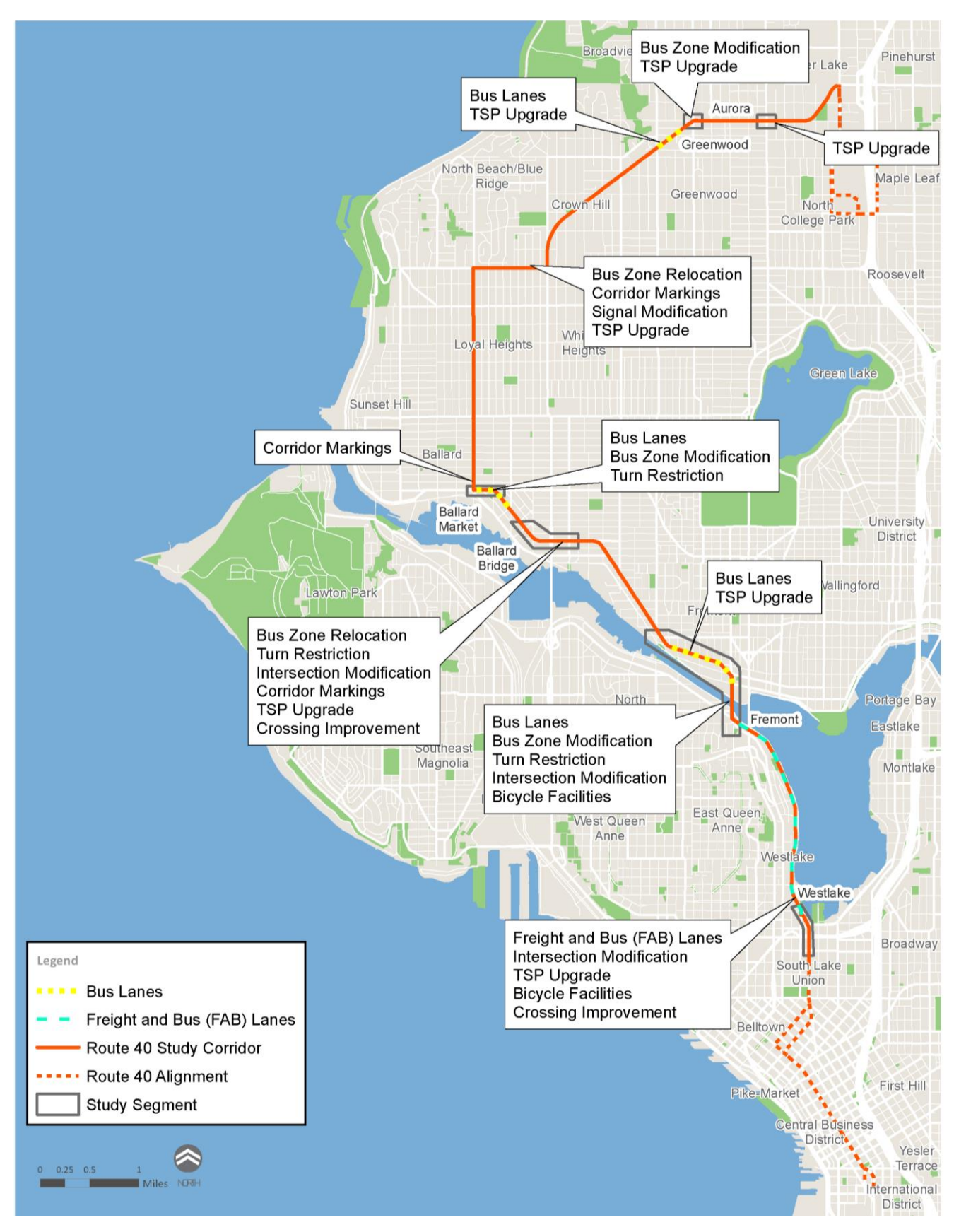
Figure 2: Route 40 Proposed Improvements