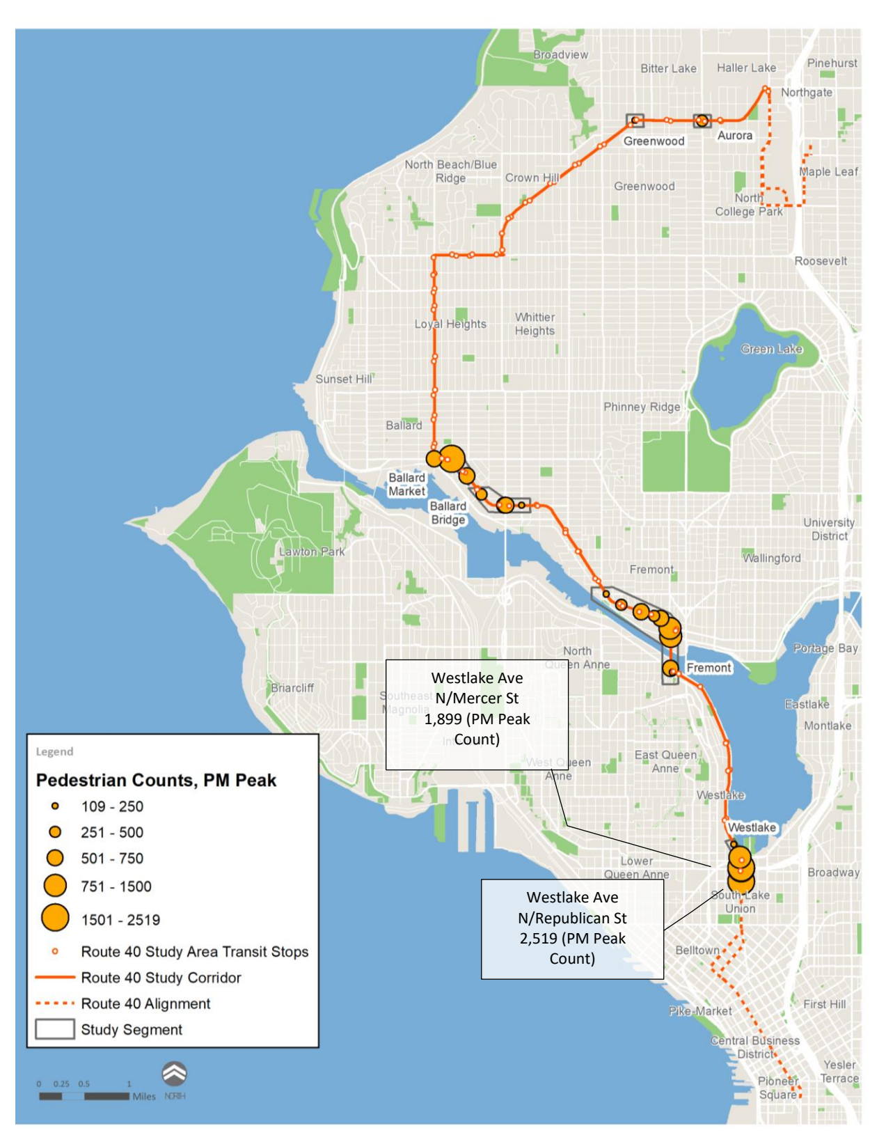
Figure 5: Pedestrian Counts by Intersection, PM Peak Period (4-6 PM)