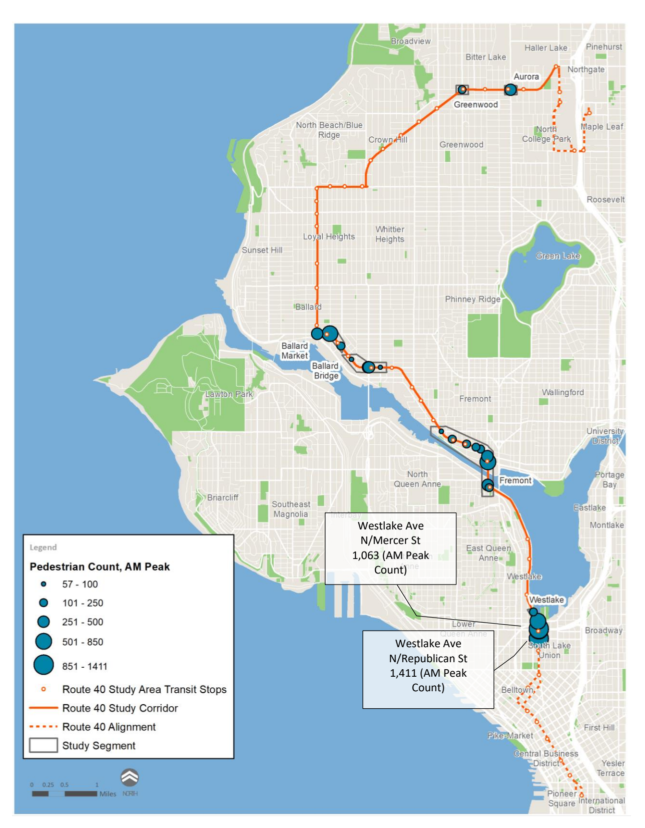
Figure 4: Pedestrian Counts by Intersection, AM Peak Period (7-9 AM)