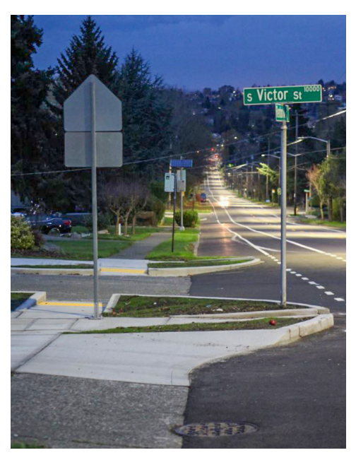
Example of a curb bulb on Renton Ave S in Rainier Beach

Curb bulbs are used to improve safety by: