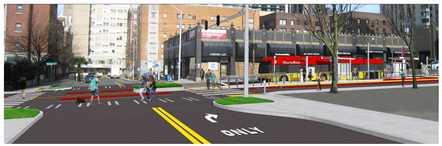
Madison St and Terry Ave