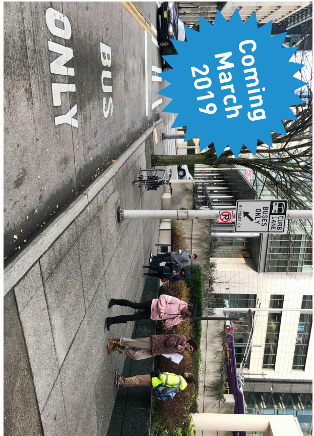
Transit pathways make buses faster and more reliable in congested urban settings like downtown Seattle.

Contact us today to get on our stakeholder list, schedule a meeting to discuss your building or business needs, and ask questions.