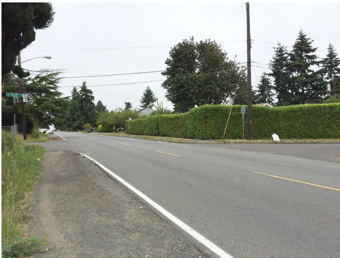
Existing conditions looking southwest at 35th Ave SW and SW 102nd St

This project is funded by the School Safety Traffic and Pedestrian Improvement Fund and the 9-year Levy to Move Seattle approved by voters in 2015. Learn more about the levy at: www.seattle.gov/transportation/LevytoMoveSeattle.htm