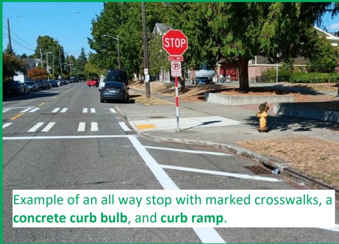
Example of an all way stop with marked crosswalks, a concrete curb bulb, and curb ramp.