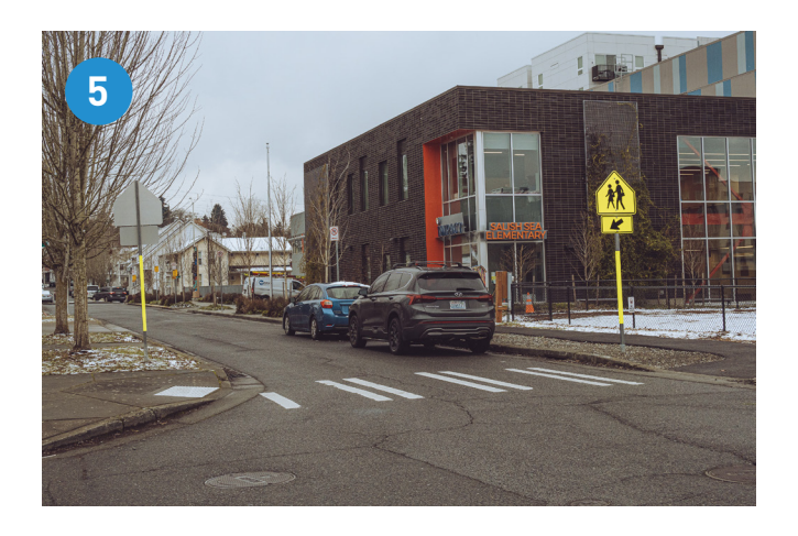
School zone signage and marked crosswalk