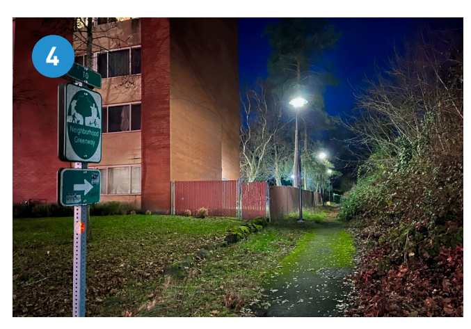
Pathway lighting next to Rainier Beach Branch Library