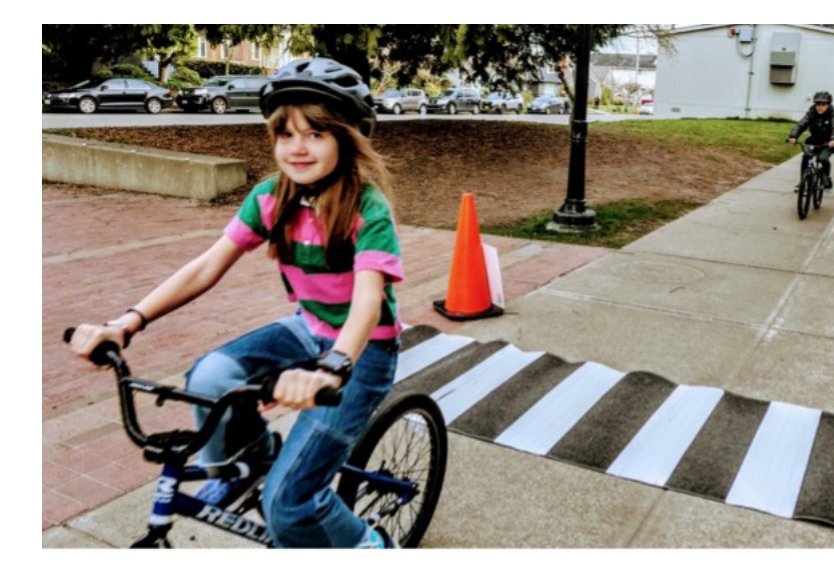
Students from Coe Elementary learning to ride at safe following distances.

Part of providing students with a safe way to walk, bike, or roll to school is giving them the ability to stay active in all types of weather. Our Mini Grant program awarded $4,000 to schools to deliver