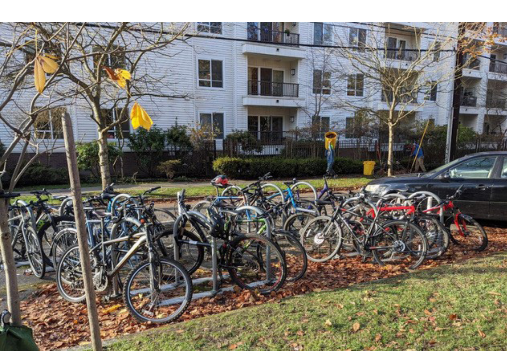
Busy bike racks outside Lincoln High School. These racks were so popular that we supplied a Mini Grant for more for the school

"My daughter walks because it's silly to drive while she lives so close to school. She has a big umbrella and waterproof shoes."