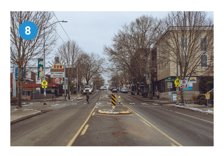
Crossing improvement at N 45th St and Woodlawn Ave N