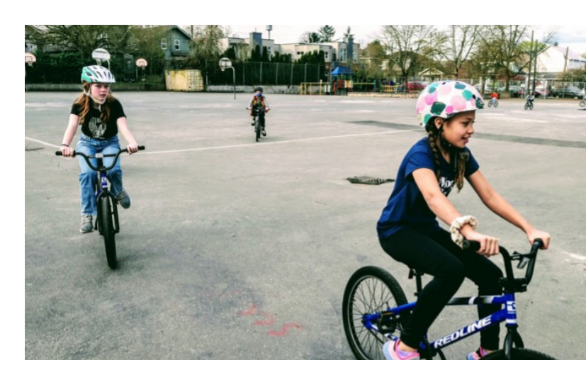
Having fun on the playground participating in the Let's Go program.

free outdoor clothing to low-income students. Students from South Shore K-8, Kimball Elementary, Lowell Elementary, and Broadview-Thompson K-8 received rain gear and winter coats to help keep them warm, dry, and safe on their walk to school.