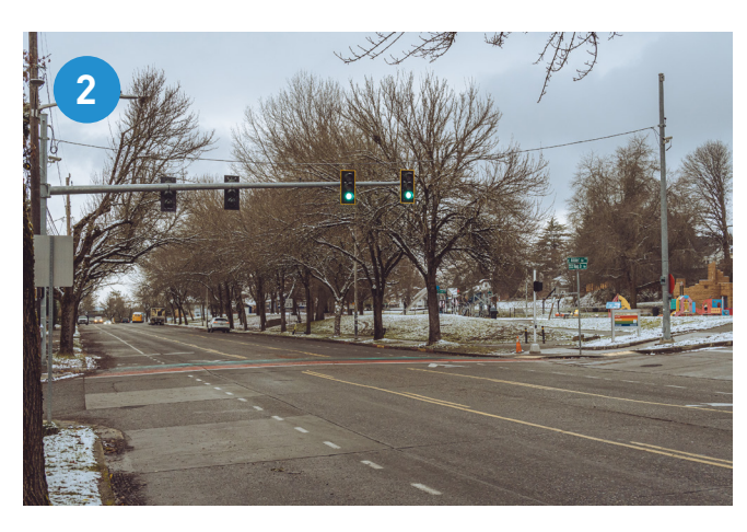
Pedestrian half signal at MLK Jr Way and E Alder St