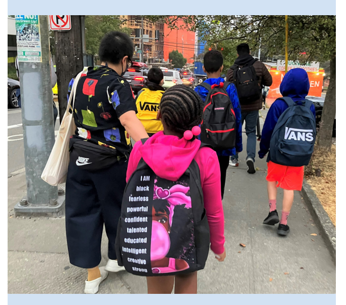
A walking school bus of students and parent leaders headed toward Bailey Gatzert

Most students at Bailey Gatzert Elementary School live within half a mile of the school, but the route to school requires crossing busy, complex arterial streets. We funded Central Seattle Greenways to help parent leaders organize walking school buses, where 25 children join one of three walking routes to get to Gatzert safely, on time, and have fun along the way. We also partnered with Woodland Park Zoo to hand out 100 zoo tickets to participating families.