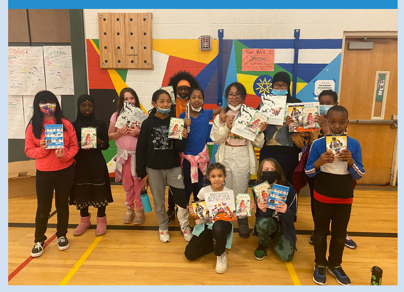
Martin Luther King Jr. Elementary students proudly showing off their new books supplied by SRTS

Reading is a great way for kids to learn about walking and biking safety and to get energized about walking, biking, and rolling to school and within their own neighborhoods.