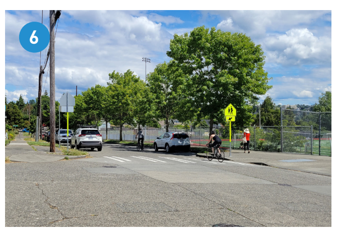
Speed humps and marked crosswalks in school zone