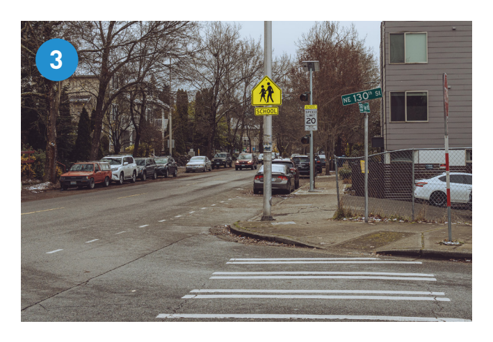
School zone flashing beacons on 35th Ave NE