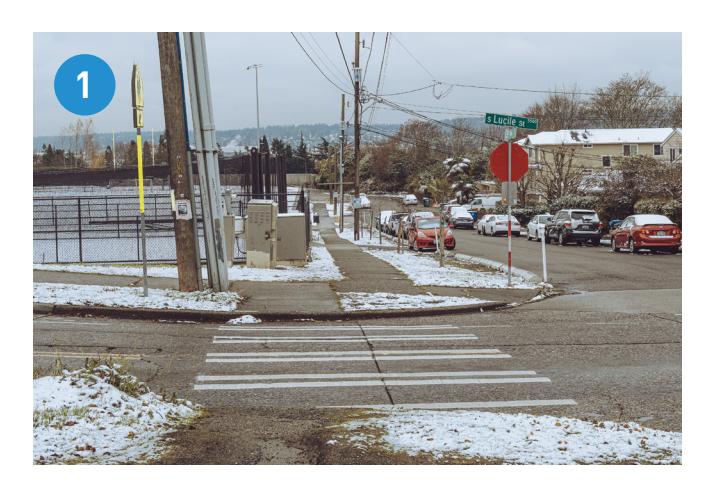
Cost effective walkway on 13th Ave S