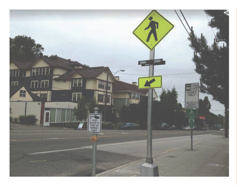
An example of a rectangular rapid flashing beacon, along with a button on a post