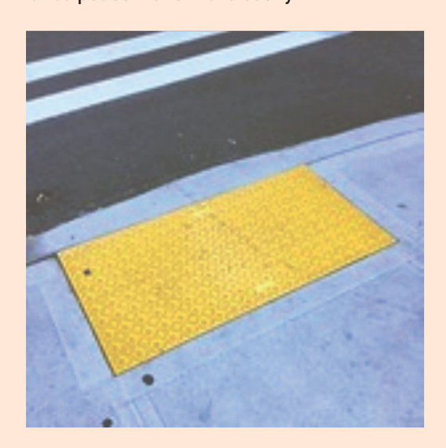
A brand-new curb ramp with its signature yellow panel and nubby texture

Curb ramps are sloped paths that make it easier for people to move from the sidewalk to the street. They often look like bright yellow squares with a nubby texture on the edges of crosswalks. People who use wheelchairs or have trouble walking use these textured pathways to let them know when they are moving from a sidewalk into the street. The bright color helps drivers notice pedestrians more easily.