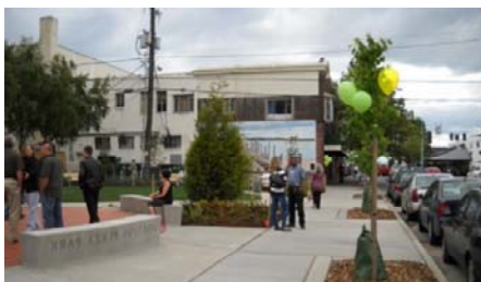
Parking at Junction Plaza Park at 42nd SW and SW Alaska St