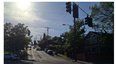
Parking at Fautleroy Way SW and SW Oregon St