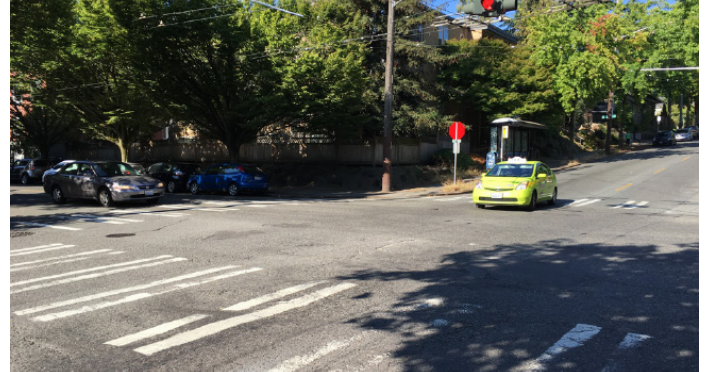
Intersection at E Thomas St and 19th Ave E

Throughout the life of the project, we'll coordinate with the King County Metro Route 8 Improvement project, our neighborhood greenway program, and with the new development at the Capitol Hill light rail station at E John St and 10th Ave E.