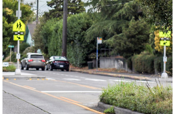
Example of Rectangular Rapid Flashing Beacons (RRFBs)