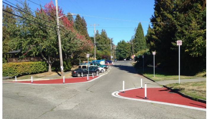
Example of painted curb bulbs with white plastic posts

The Seattle Department of Transportation (SDOT) will make improvements along S Jackson St between 20th Pl S and Martin Luther King Jr Way S to enhance pedestrian safety, improve connections and efficiency, and help make this part of the S Jackson St neighborhood's "Main Street." In 2016, the S Jackson St Corridor Improvements project was one of 12 selected by the Levy to Move Seattle Oversight Committee to be funded through SDOT's Neighborhood Street Fund (NSF) program. The NSF program funds projects requested by the community.