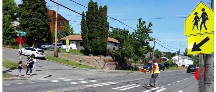
Looking northeast from the southeast corner of the intersection of S Genesee St and Cascadia Ave S