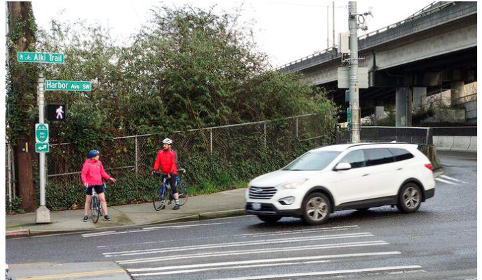
People waiting to cross the intersection at Harbor Ave SW and SW Spokane St