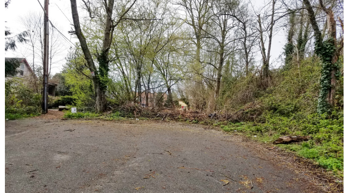
Existing unimproved walkway on 26th Ave SW at SW Trenton St

In 2016, the Chief Sealth High School Walkway project was one of 12 selected by the Levy to Move Seattle Oversight Committee to be funded through the SDOT's Neighborhood Street Fund (NSF) program. The NSF program funds projects requested by the community.