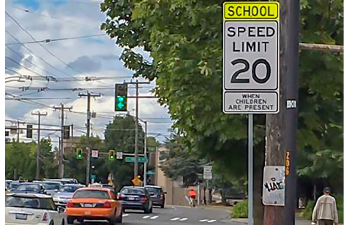
Existing school zone signage on 12th Ave S