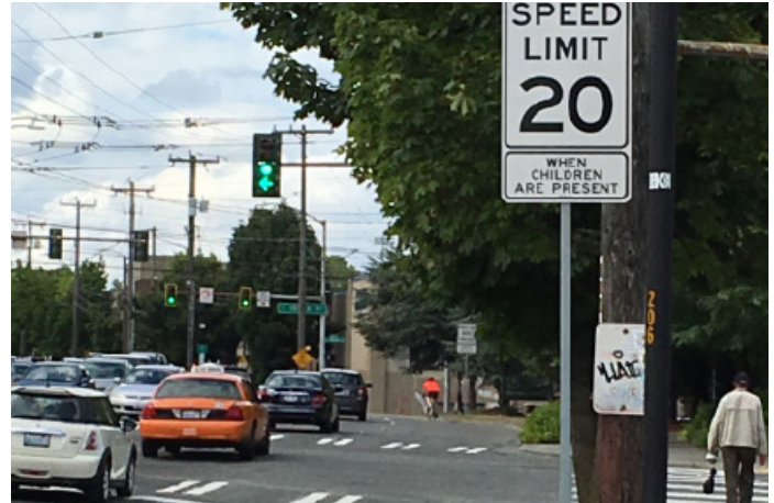
Existing school zone signage on 12th Ave S