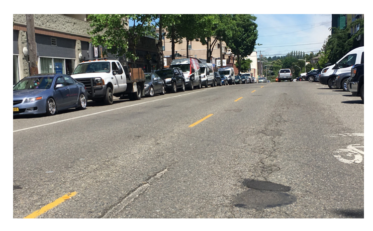
University Way NE is ready for repaving.

We know how important it is to maintain our streets and our Paving Program helps take care of the basics by rehabilitating arterial streets each year. Arterial streets are primary routes for moving people and goods through the city. They connect neighborhoods and business districts to one another and to the regional transportation network. Keeping our transportation system in a state of good repair helps lower the cost of future maintenance.