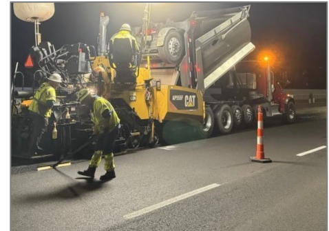
Example of road surface being paved.