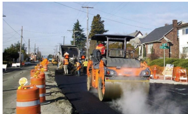
Examples of crews paving the street

If you have concerns about nighttime construction noise or access during the work, please contact us at: 206-512-3950