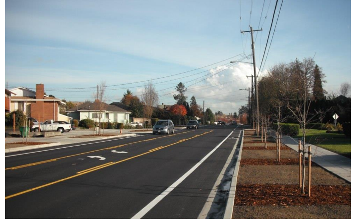
Existing bike lanes on S Columbian Way