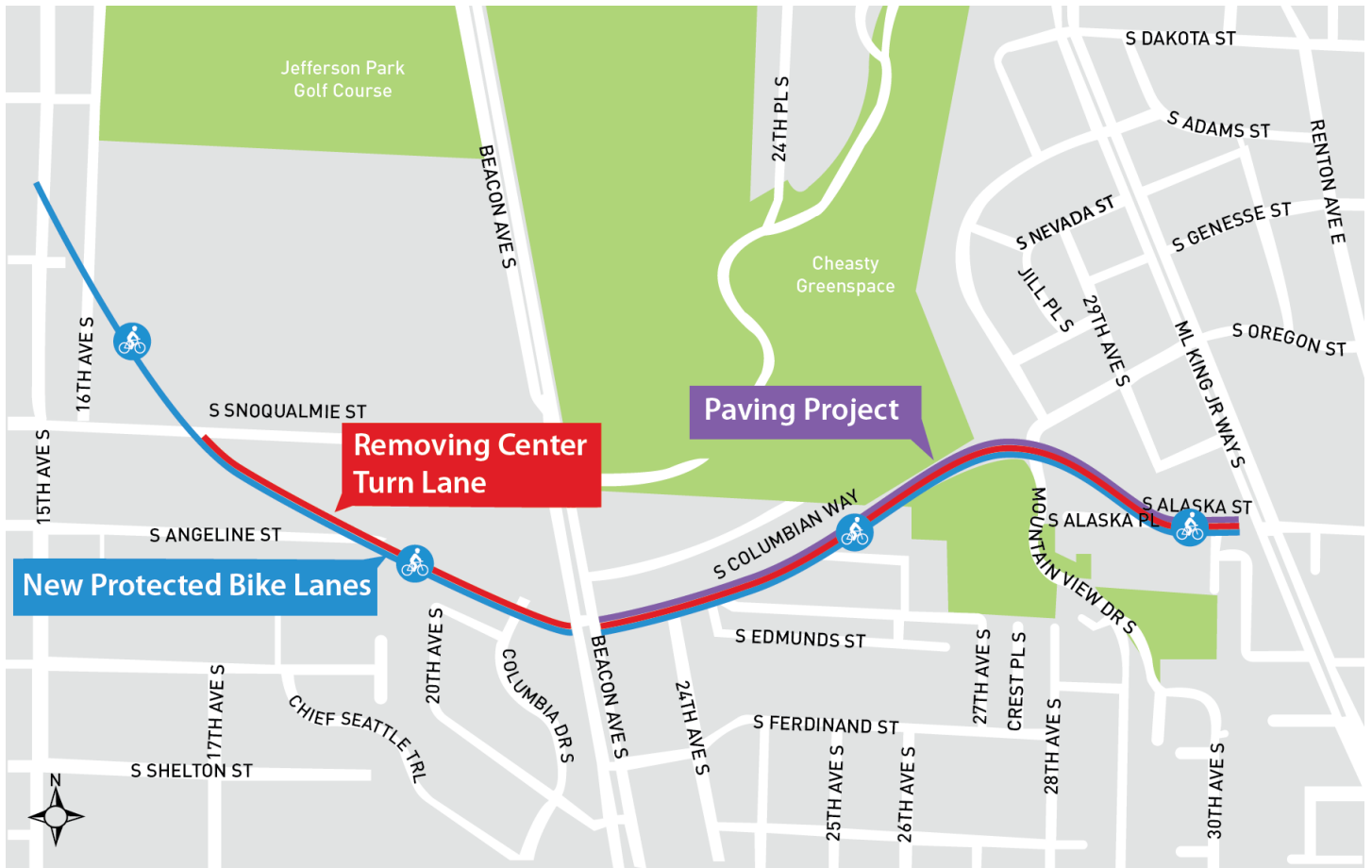
Map of protected bike lanes coming to S Columbian Way between 15th Ave S and Martin Luther King Jr. Way