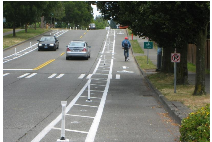
Protected bike lanes on N 92nd St

Stay connected! Sign up for email updates by visiting: