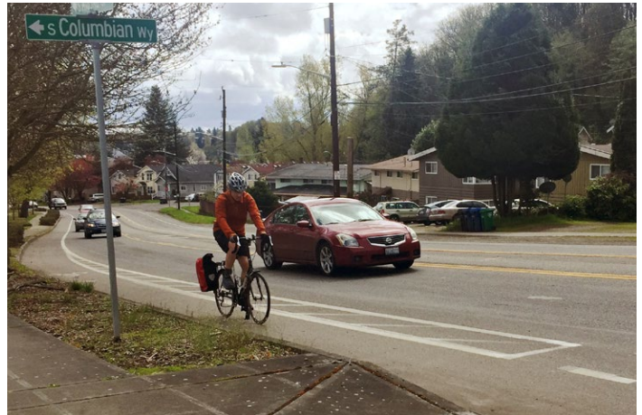
S Columbian Way/S Alaska St needs to be repaved