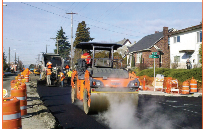
Example of crews completing a mill and overlay paving project.