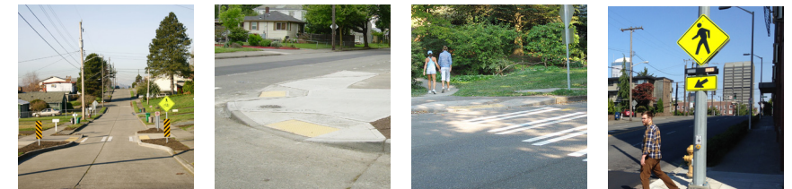
1 Curb bulb 2 Curb ramp 3 Crosswalk 4 Crossing beacon