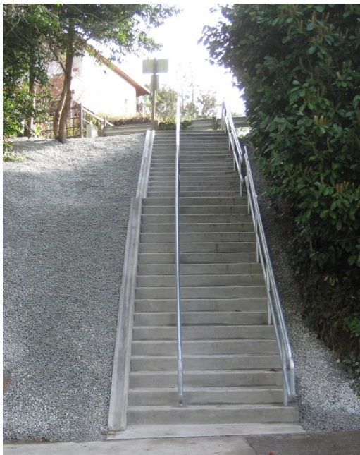
Example of a new stairway with a bike "runnel" that allows people to roll their bikes next to them