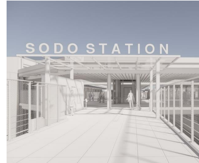
Image: Sound Transit, Presentation to the Seattle Design Commission, Potential pedestrian access design concept, November 2024