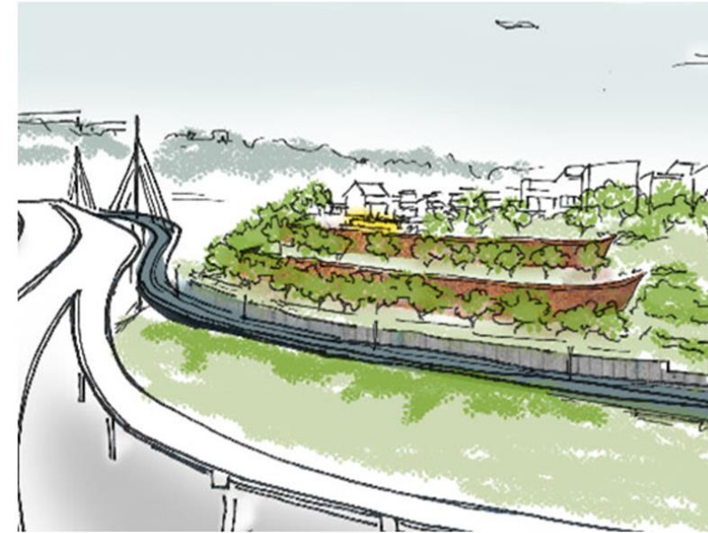
Image: Sound Transit, Presentation to the Seattle Design Commission, Potential terraced design concept, July 2024