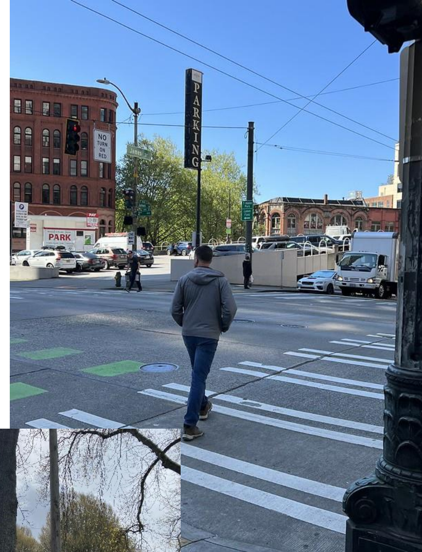
Bottom: New curb ramps near Stevens Elementary School.