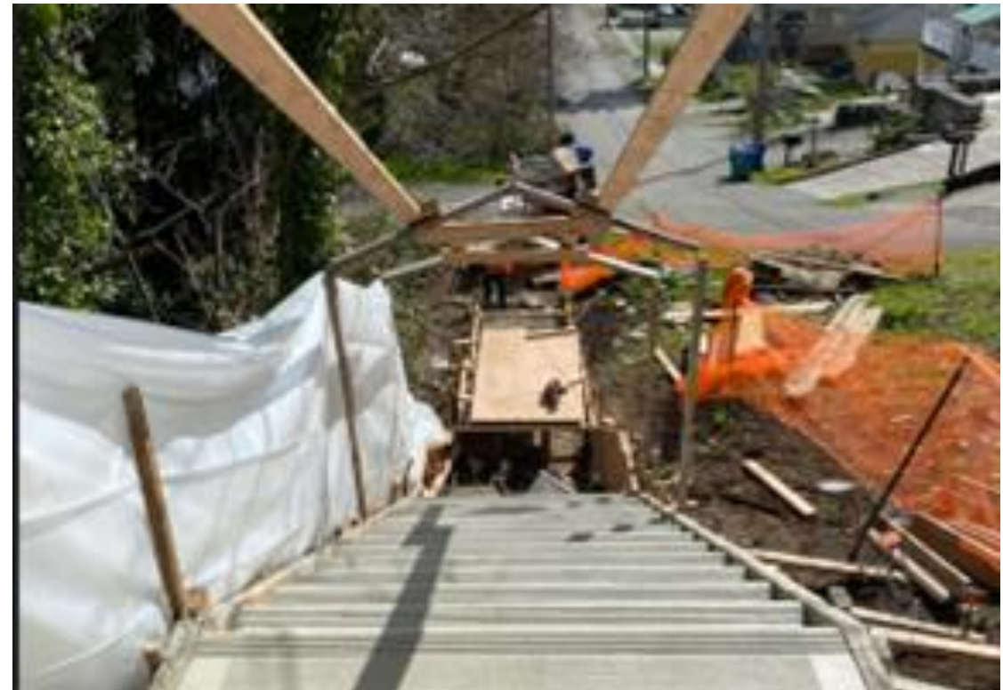
Bottom: Stairway at S Morgan St under construction.