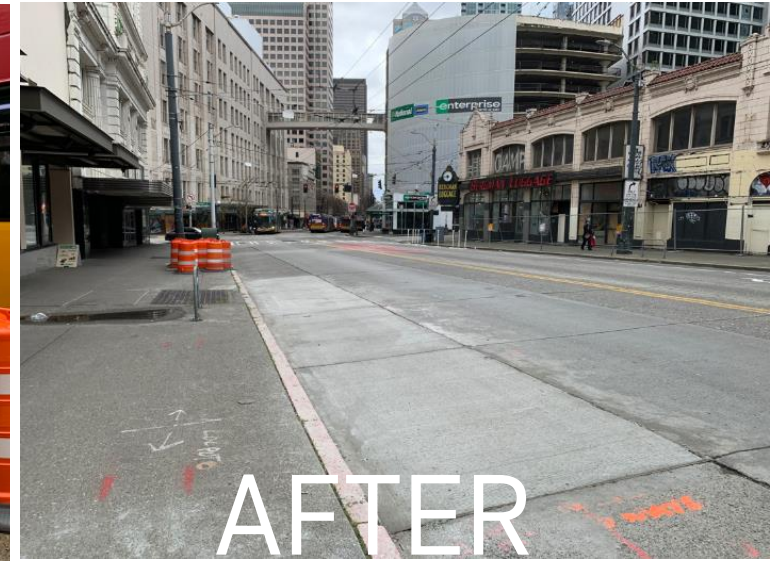
Top: Before and after repaving on 3rd Ave between Stewart St & Virginia St.