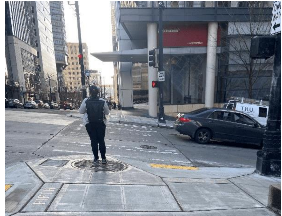
Bottom: New ADA curb ramps at 5th Ave and Madison St at part of Madison RapidRide G Line project.