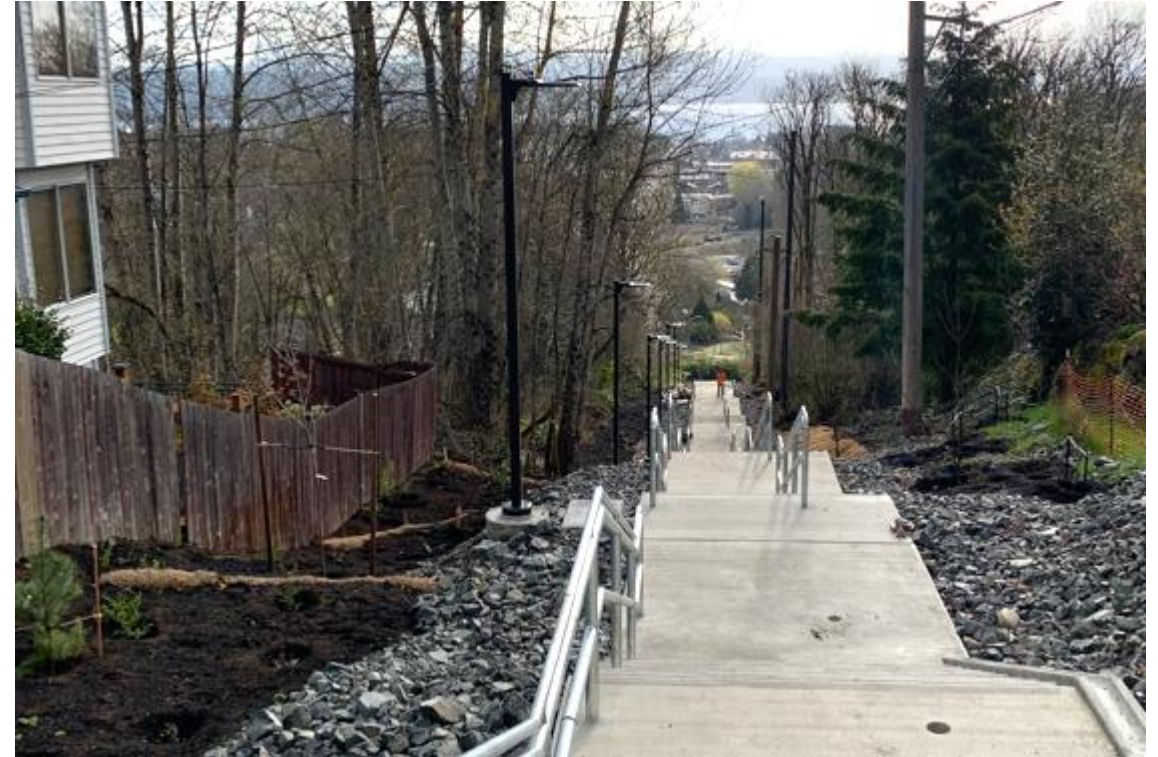
New stairway at S Henderson St.