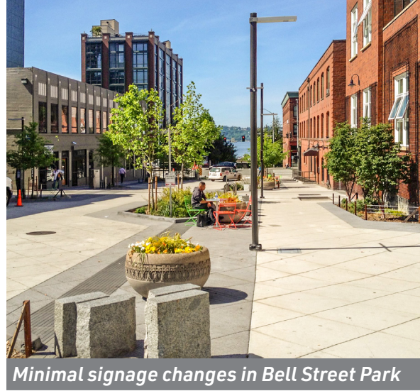
Minimal signage changes in Bell Street Park