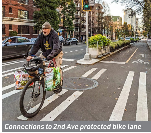
Connections to 2nd Ave protected bike lane