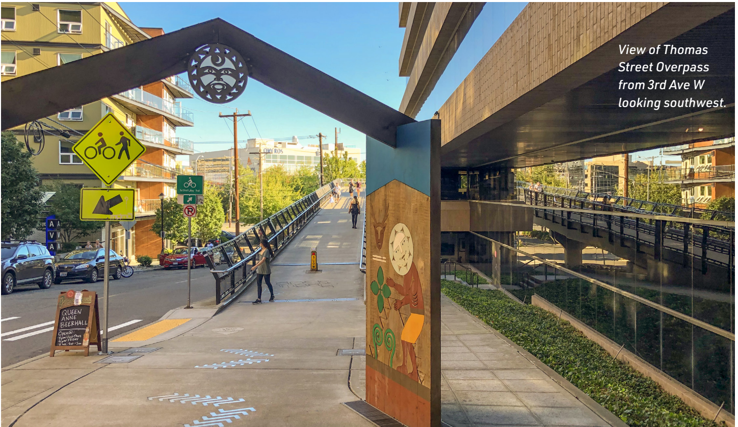
View of Thomas Street Overpass from 3rd Ave W looking southwest.