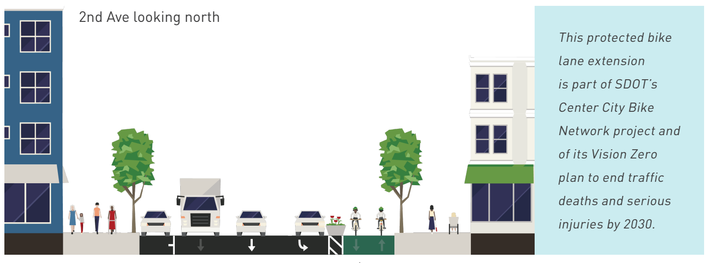
Typical cross section with new 2-way protected bike lane and left turn lane/parking lane. Cross section graphic created using StreetMix.com