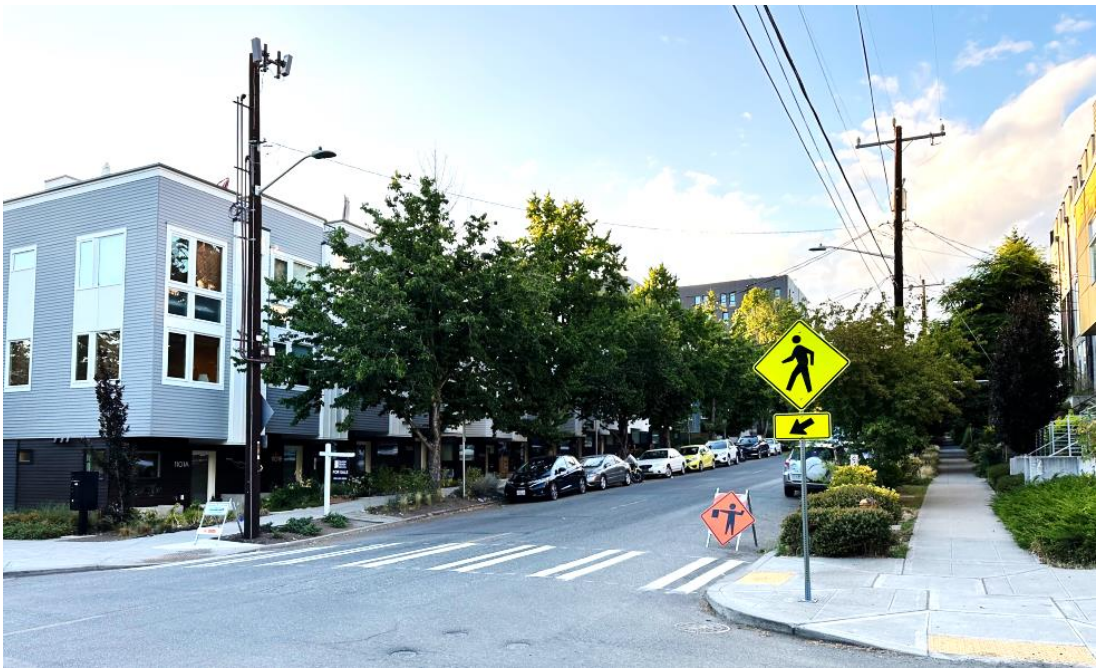
Program 25 – New marked crosswalk at Spring St and 14th Ave in Capitol Hill.