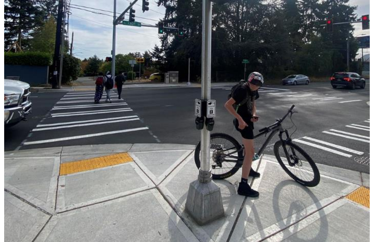
Program 4 – New signal at N 130th St and Ashworth Ave N (a partnership with the NSF program).