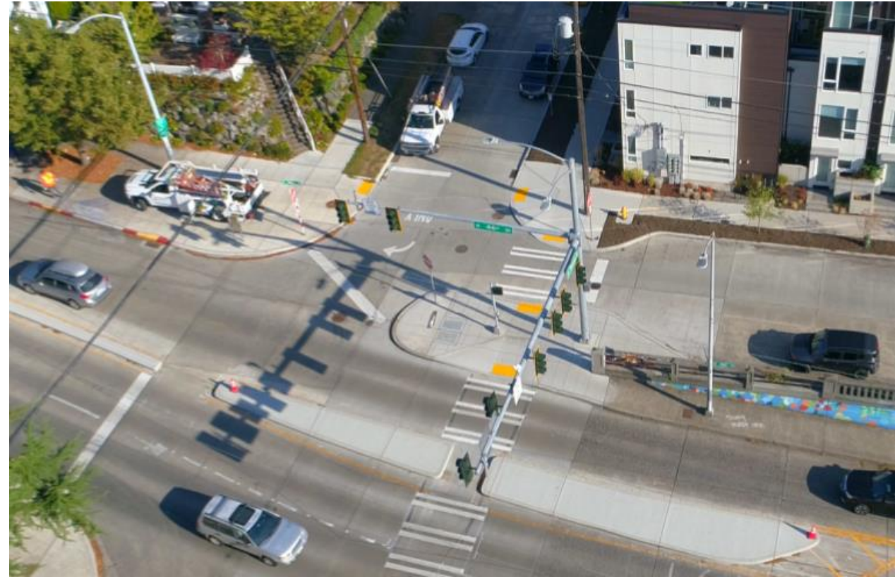
Program 18 – Aerial view of N 46th St and Aurora Ave N, showing an expanded bus stop, new signalized crosswalk, curb ramps and sidewalk upgrades, repaving, pedestrian lights, westbound protected left turn, and much more. This intersection was one of many improved as part of the Route 44 Transit Plus Multimodal Corridor project.