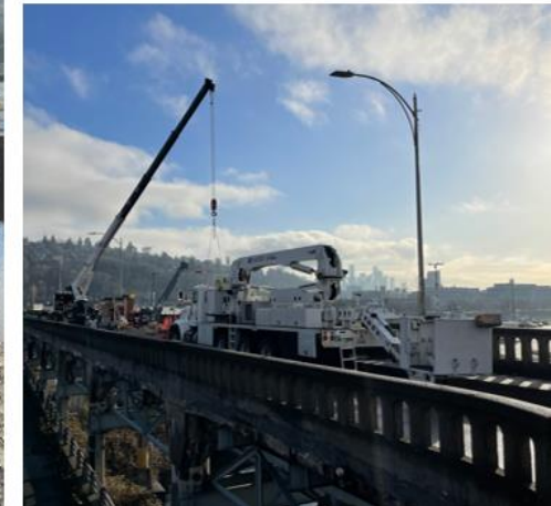
Program 11 – SDOT performed repairs on the Magnolia Bridge in December 2023.