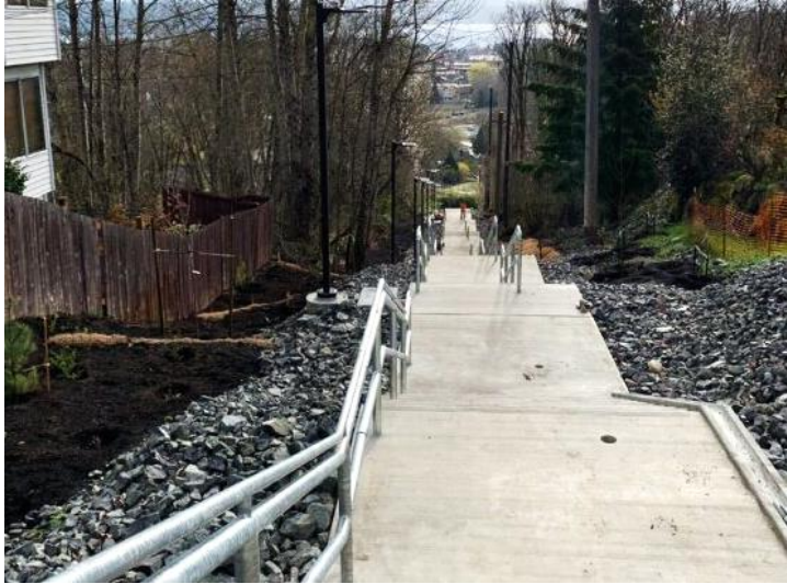
Program 25 – New sidewalk on S Rose St (left) and new stairway at S Henderson St in South Beacon Hill (right)