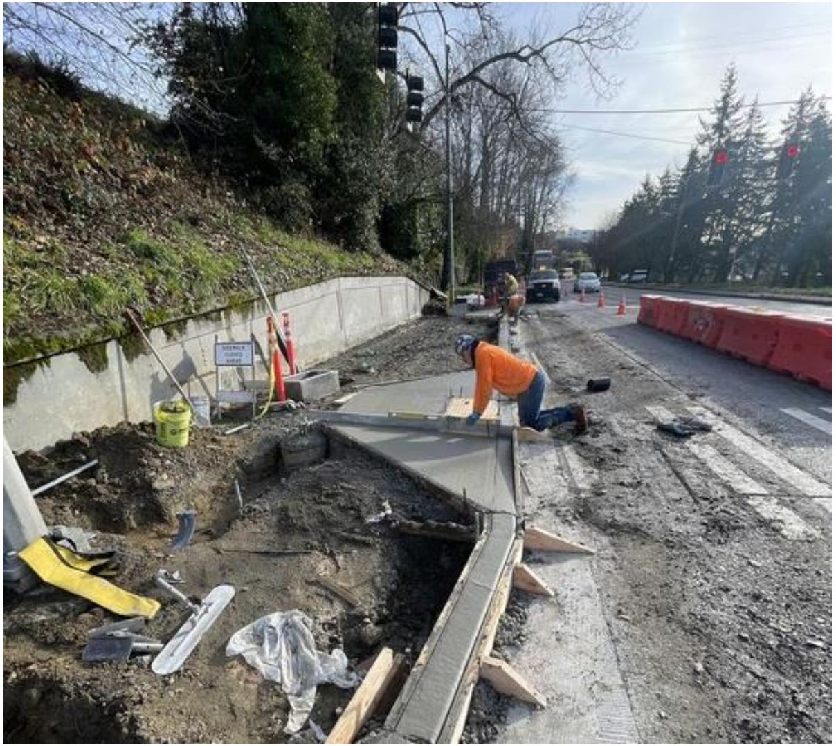
Crews installing curbs and curb ramps on the east side of MLK Jr Way S and S Bayview St as part of the MLK Jr Way Safety Project.