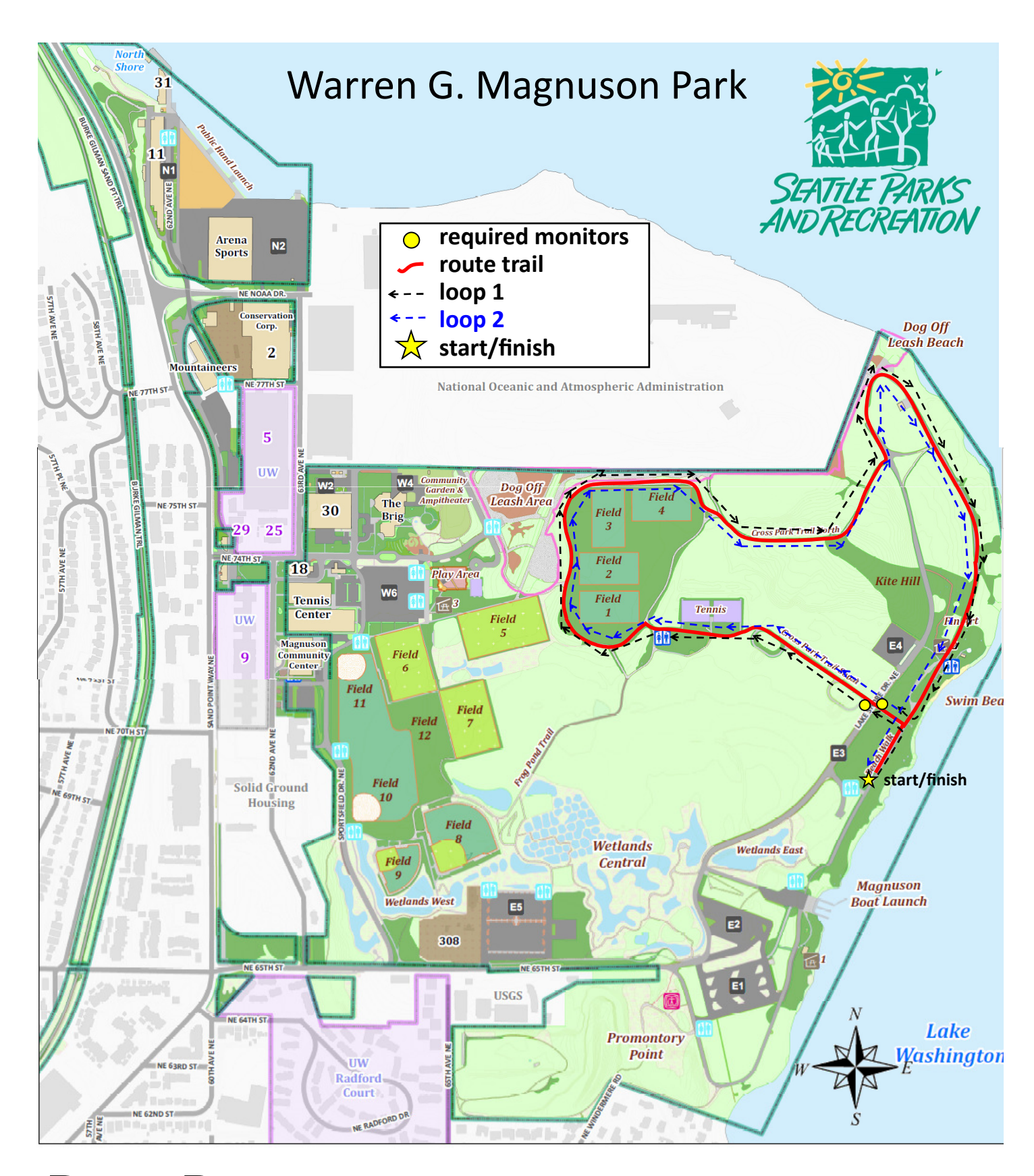
Route B - (distance 5k)

All routes must meet Run/Walk Guidelines document, and must be approved for your event. Course monitors required!