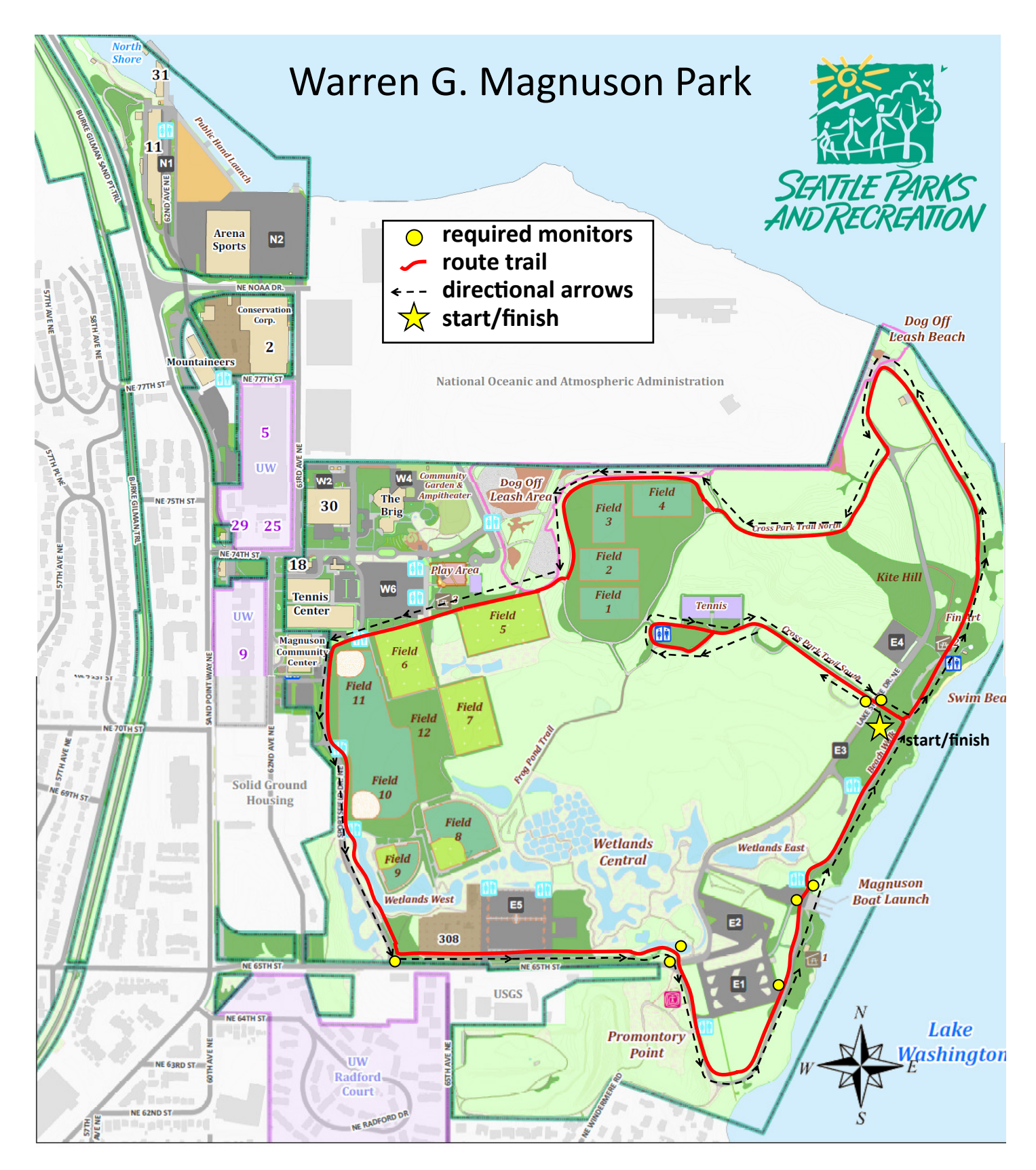
Route D - Available October-March. Cannot be timed, All routes must meet Run/Walk Guidelines document, and must be approved for your event. Course monitors required!