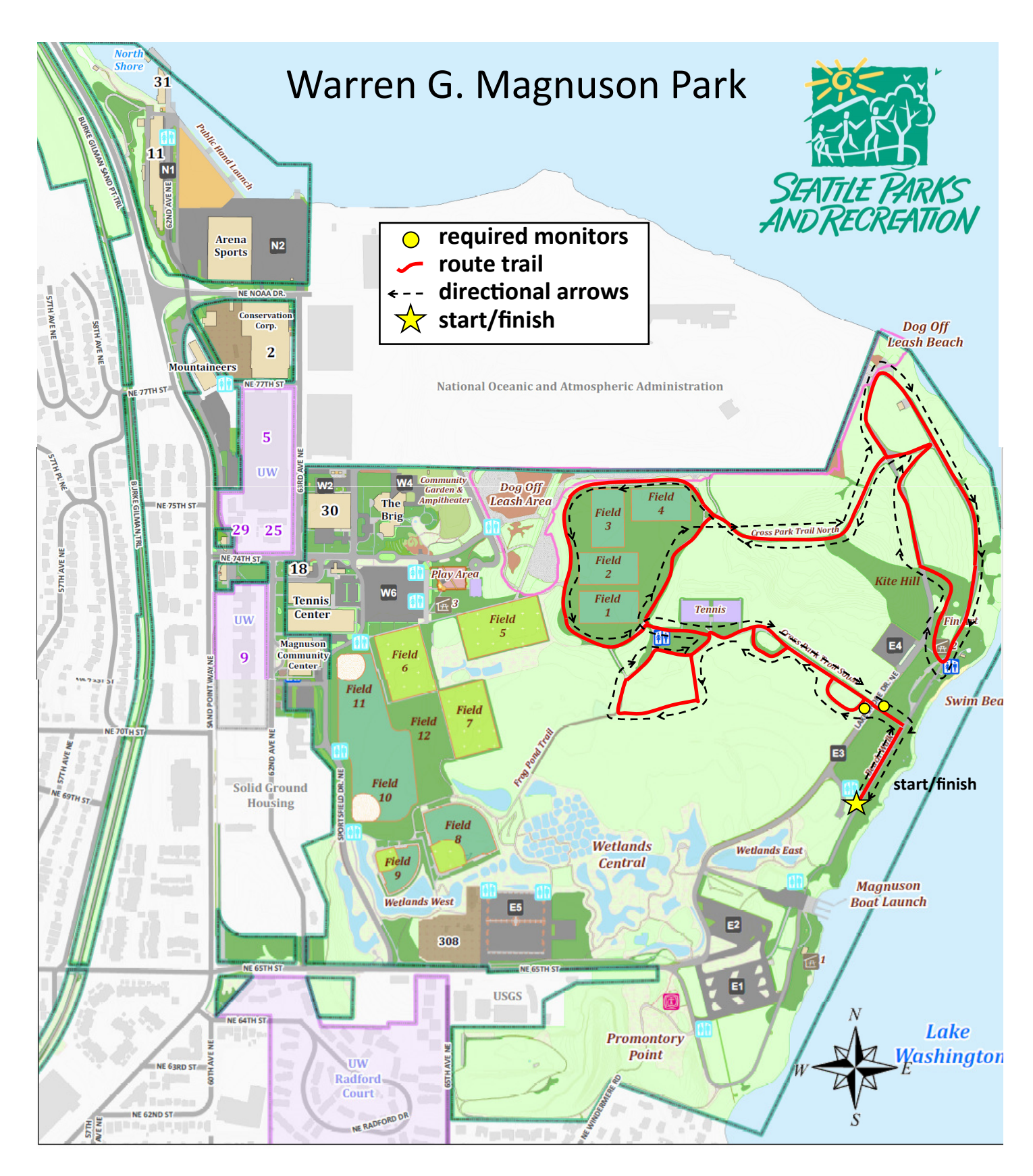
Route A - (distance 5k)

All routes must meet Run/Walk Guidelines document, and must be approved for your event. Course monitors required!