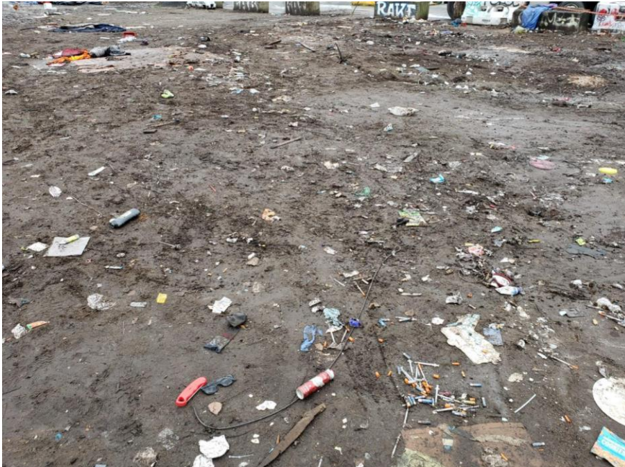
1/5 - After