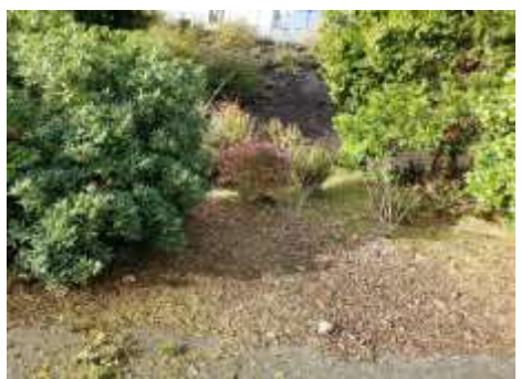
Line trimming before laying burlap