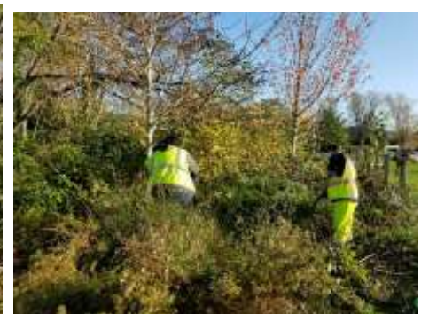
Line trimming interior along fence line