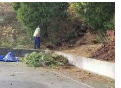
Laying burlap for weed suppression before mulching