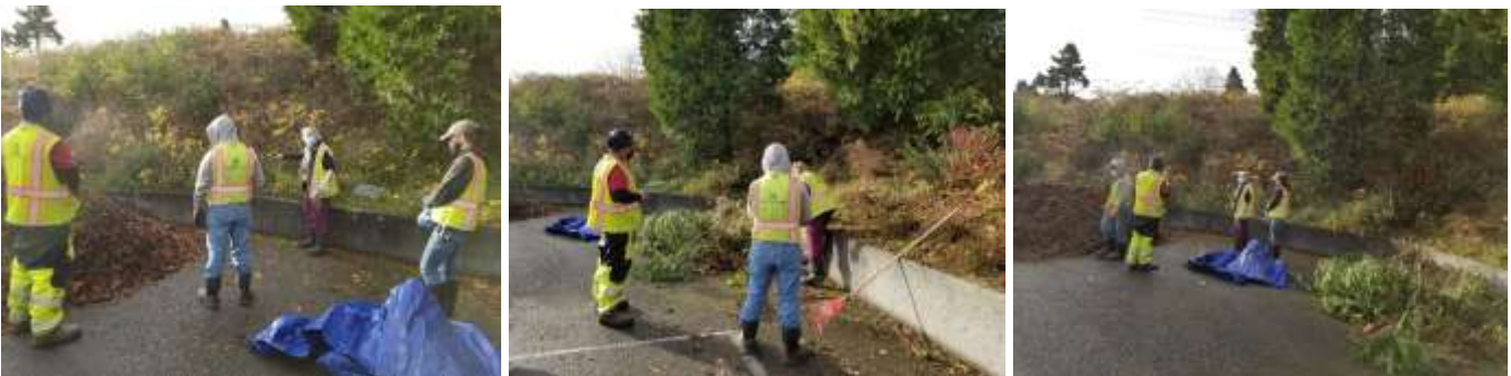
Sr. Gardener discussing the workplan with the crew