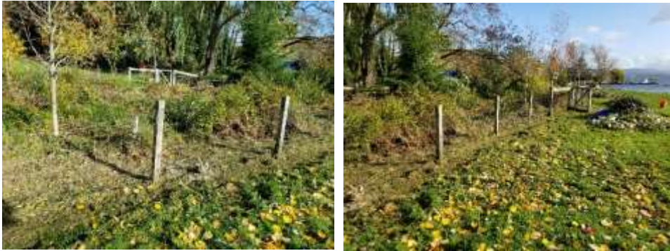
Removing tree cuttings