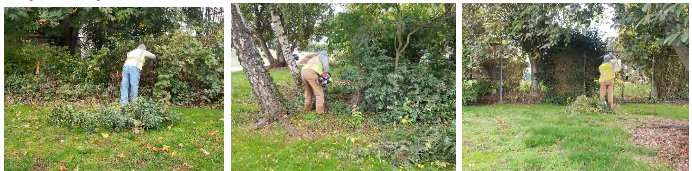
Shrub bed maintenance, laying burlap and mulching