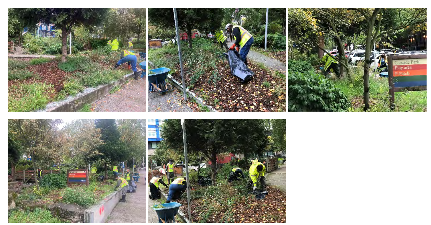
Line trimming prep work and laying burlap for weed suppression