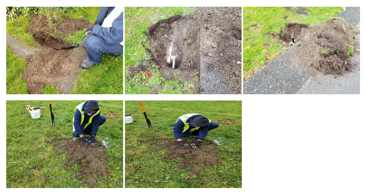
Testing irrigation zones by running a clock system