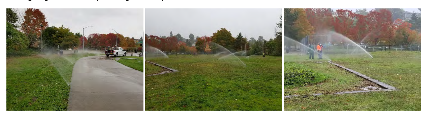
Spraying with white paint to mark broken heads, heads that don't rise or geysers