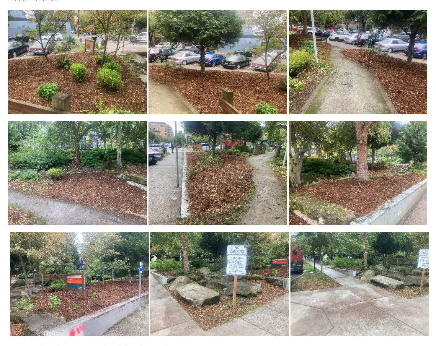
Litter and garbage removal and clearing pathway