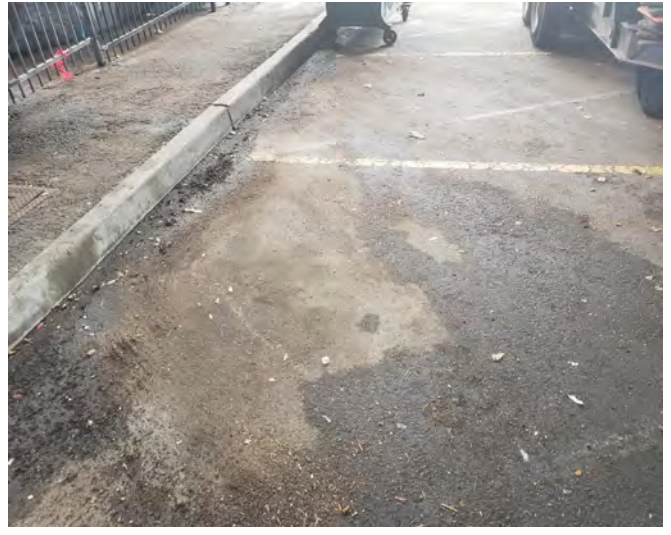
• 4<sup>th</sup> and Royal Brougham: 25-Tents, 5-Structures, 250-Needles, 1,500lbs of debris -9/27