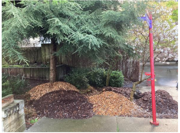
Beds mulch spread