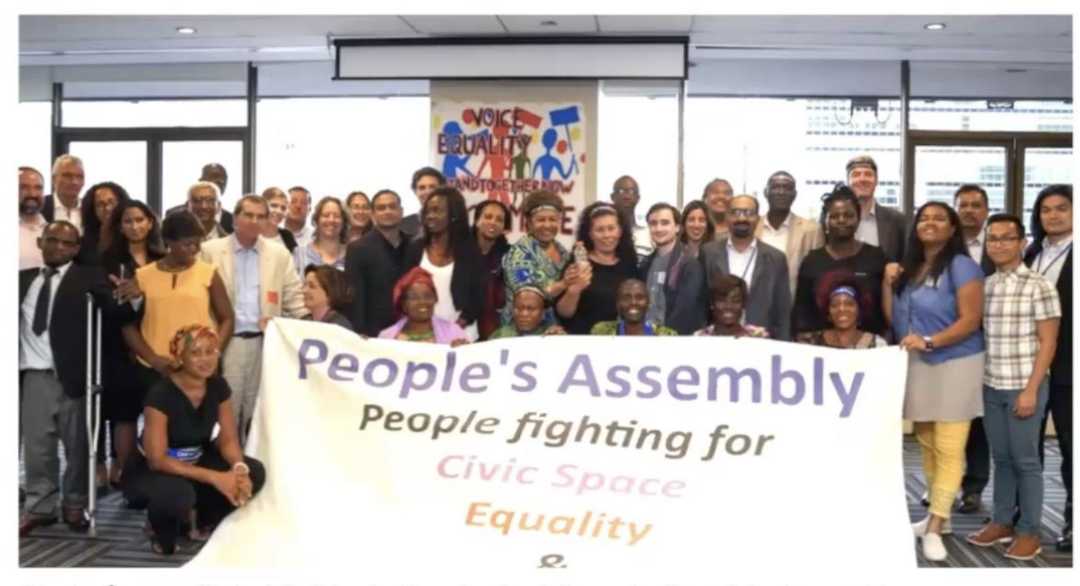
Photo from a Global Call to Action Against Poverty People's Assembly