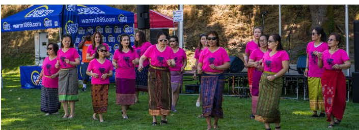
Culture, Arts, and Community