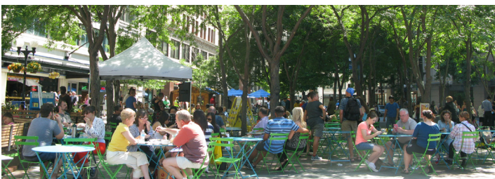
Equitable Access to Public Space