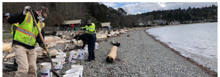
Environmental Justice and Environmental Health