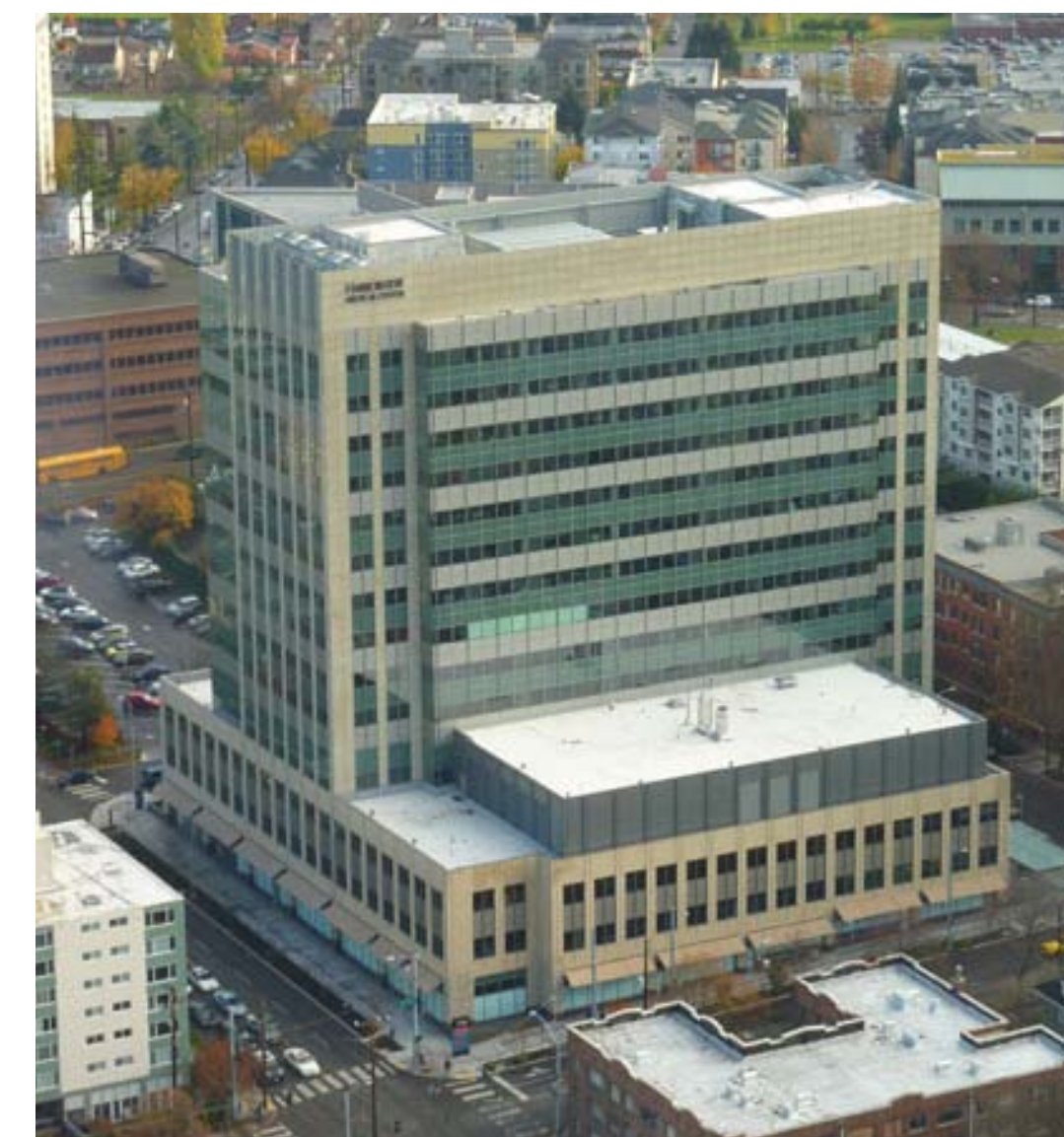
Project: Harborview Type: Medical Floor plate: ~18,000 sf (highrise)