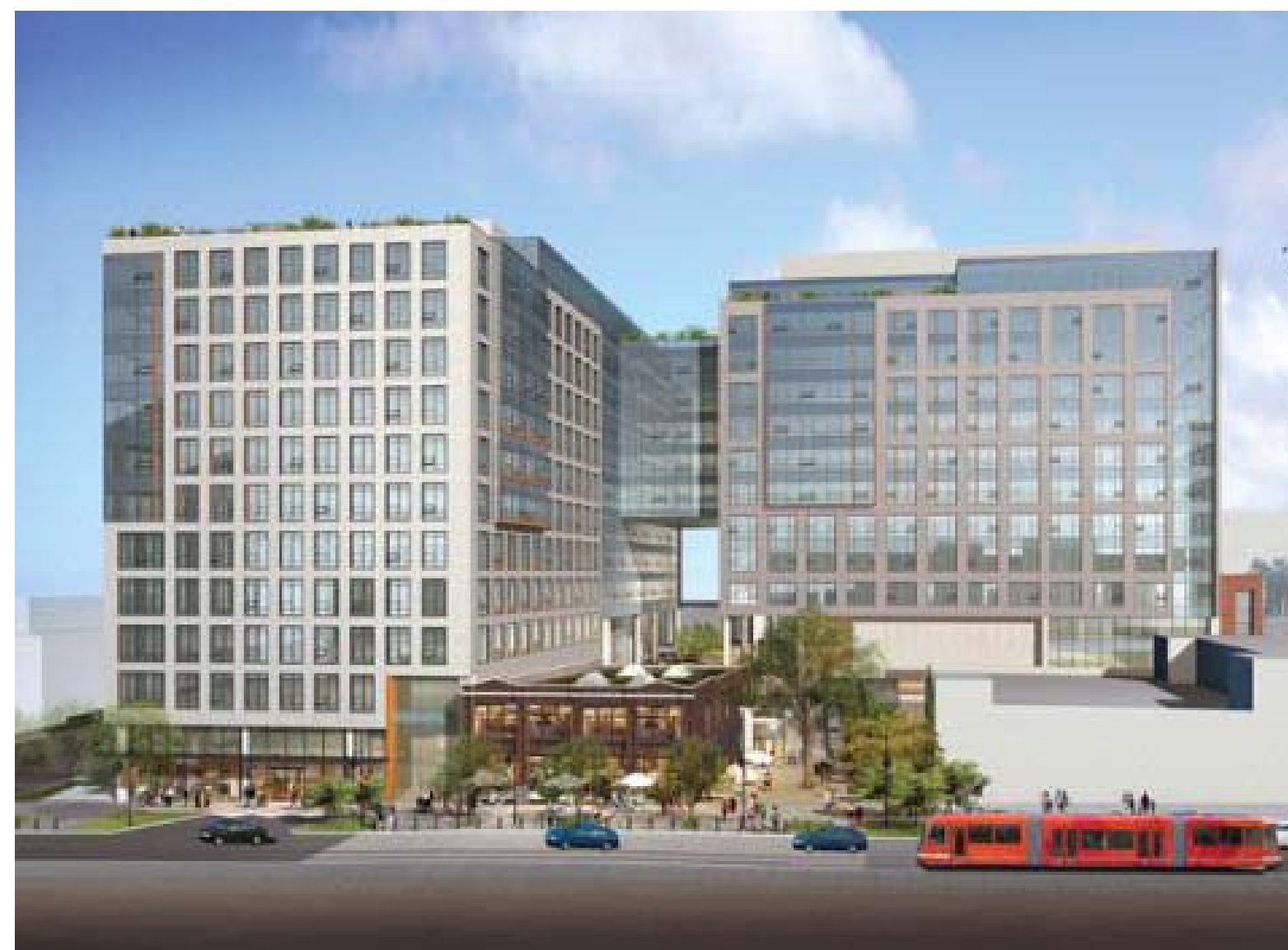
Project: Amazon Phase IV Type: Commercial Floor plate: ~43,000 sf