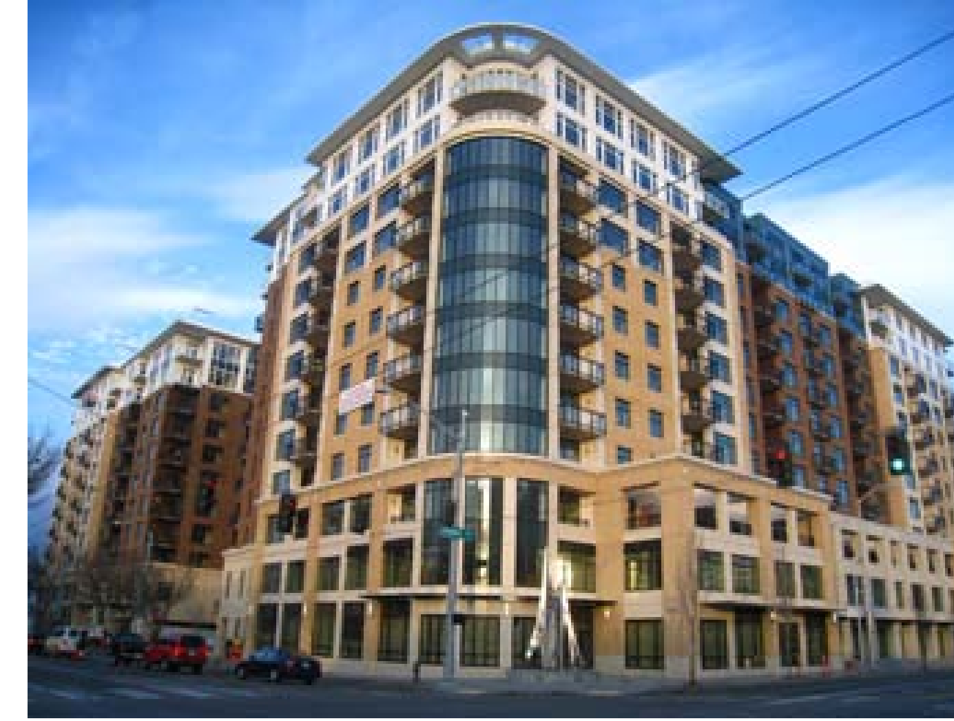
Project: Mirabella Type: Residential Footprint: ~58,000 sf