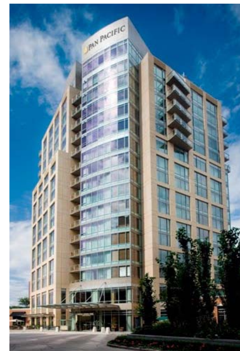
Project: Pan Pacific Type: Lodging Floor plate: ~10,000