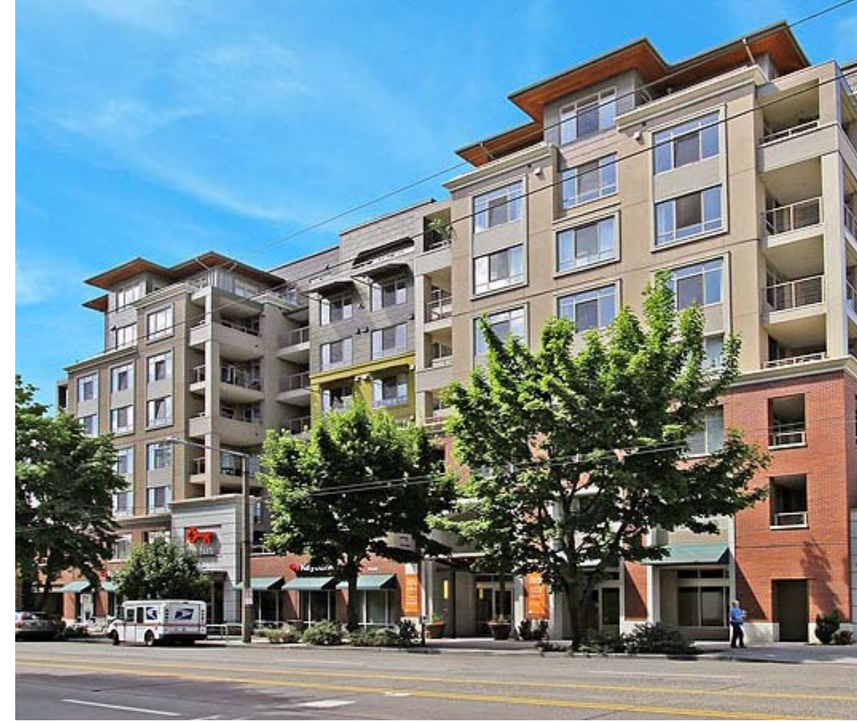
Project: Hjarta Type: Mixed use Footprint: ~16,500 sf