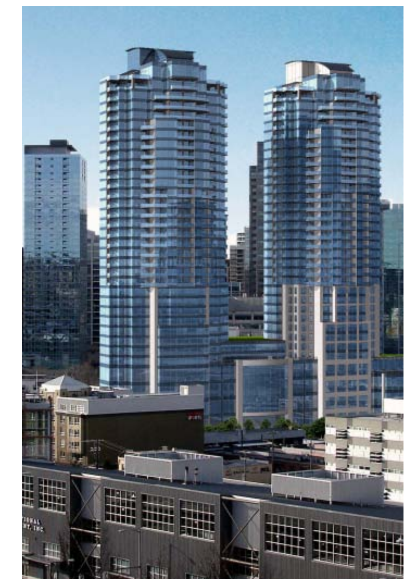
Project: 1200 Stewart Street Type: Residential Floor plate: ~10,500 (proposed)