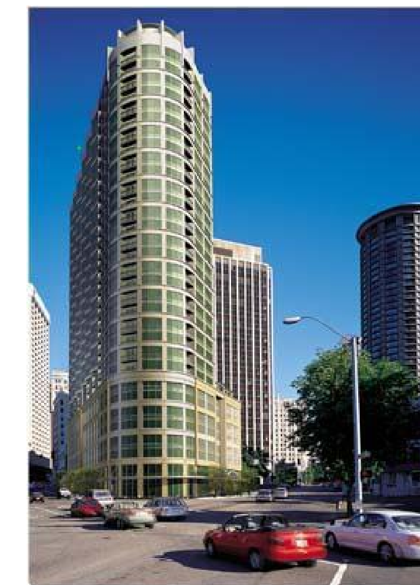
Project: Metropolitan Tower Apts Type: Mixed use Floor plate: ~16,000