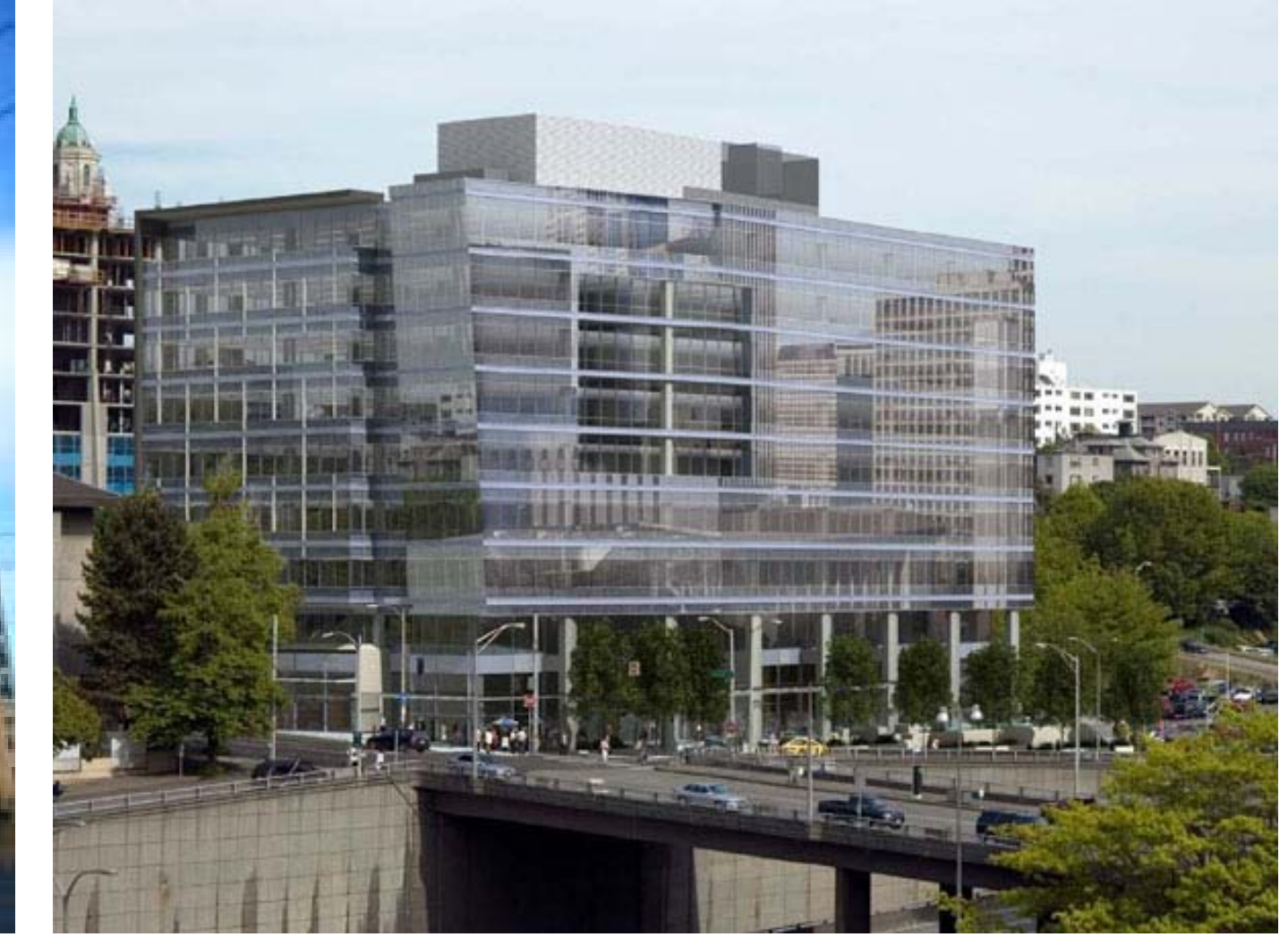
Project: 7th & Madison Type: Commercial Footprint: ~18,000