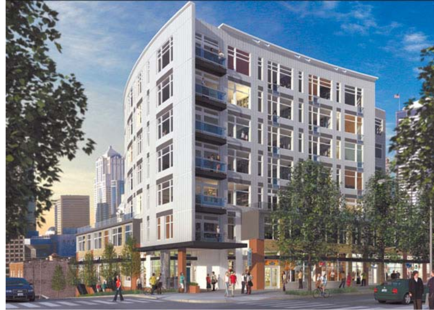
Project: Landes Apartments Type: Mixed use Footprint: ~9,500 sf