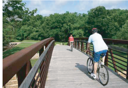
Connect the Licton Springs neighborhood to light rail with a ped/bike bridge over I-5