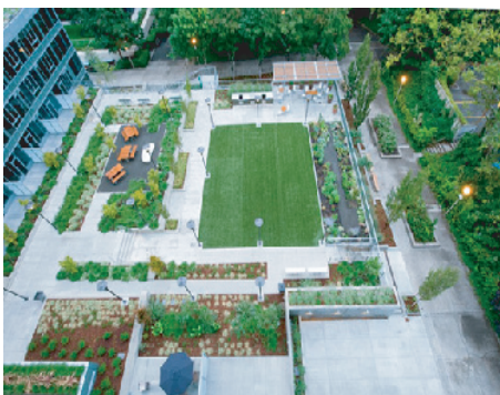
Provide a new park gathering place along Meridian Avenue N.