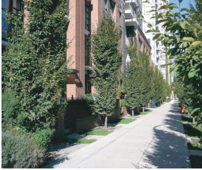
Improve a pedestrian connection toward Aurora Avenue N.