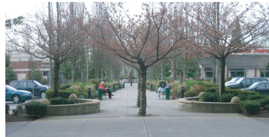
Add more mid-block connections through superblocks