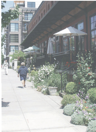
Upgrade streetscape on Meridian Avenue N.