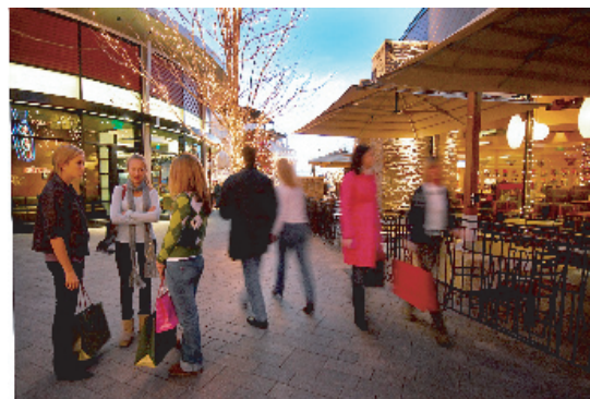
Add new livable activity centers with future growth