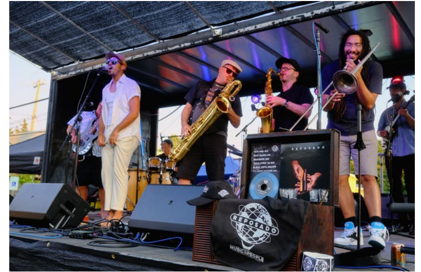
Cultivate South Park