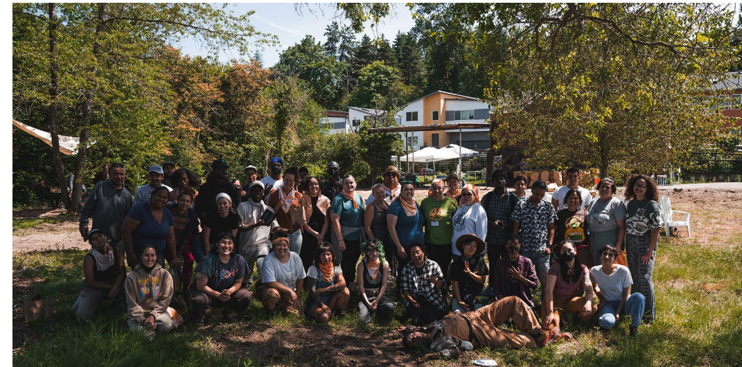
yəhaw' Indigenous Creatives Collective