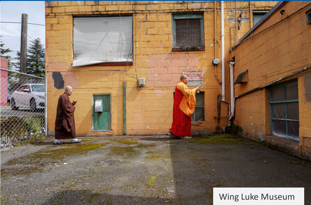
Wing Luke Museum