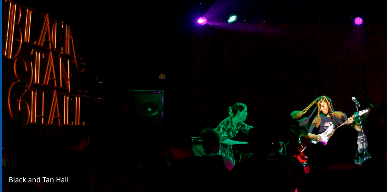
Black and Tan Hall