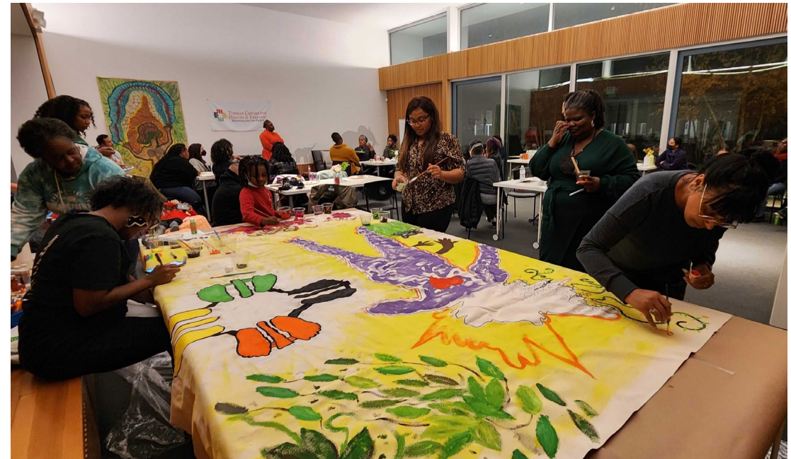
Tubman Center for Health and Freedom