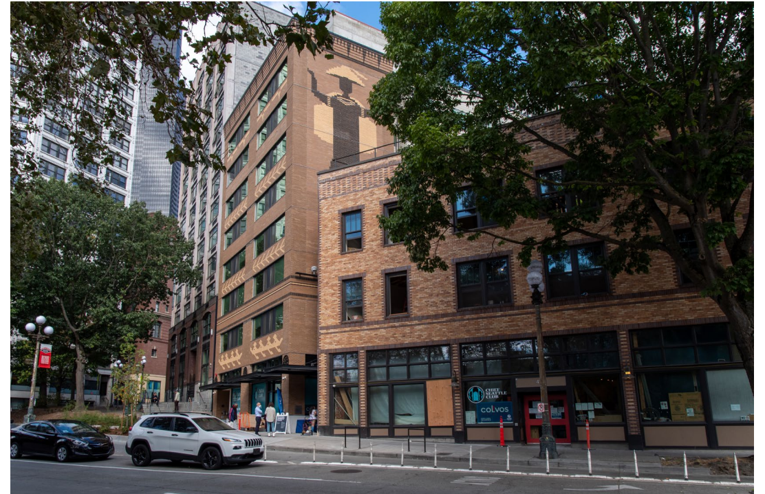
Chief Seattle Club