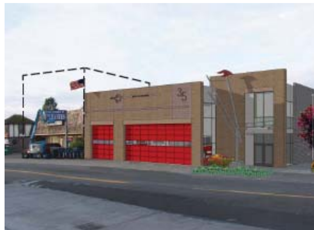
Figure 3: Southwest View of Station

The design elements of the project have changed. The front façade now consists of only two portals with strong masonry components with connecting membranes, not three portals. Originally a brick veneer was proposed, now looking at a more subtle gesture of ground CMU (color not determined) and banding; signage will be of other materials. It will be a monolithic statement of color, with light identifying the interior uses; in addition, the exterior won't overpower the artwork. The team is looking at jointing of masonry. Most of the glazing of the apparatus bay doors has been eliminated due to Fire Department