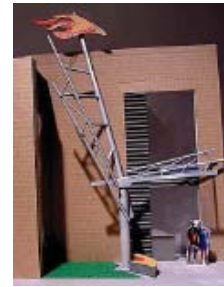
Figure 4: Art Location

The entry point would be the location for the art piece. Weaving a story of nature of fire service, it will be a stand-alone identifier for the building. The team is looking into the possibility of having the cistern be part of the art piece, and is working with the artist on this concept. The exact position of the artwork is still being determined now that it is focused in one area and not scattered as previously presented.