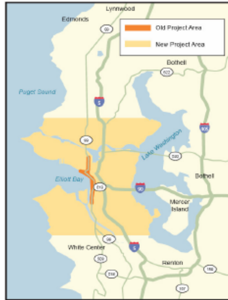
Figure 1: Project Area Changes

The Urban Mobility Plan will develop solutions for a surface/transit option for replacing the Viaduct. The first one third of the projects are already underway and are addressing the most severe portions of the viaduct. However, the team does want to move expeditiously on the central waterfront portion as well. Many projects across the state experienced delays this past year, and don't want that to happen with the UMP. Various groups have been set up to facilitate this including a stakeholder advisory committee, an interagency working group and various public engagement sessions. Consultants have also been hired to help with the project. Throughout the process the team is looking at five building block elements: surface streets, transit, I-5 (through-routes), SR 99, and 'other' (policies and management strategies).