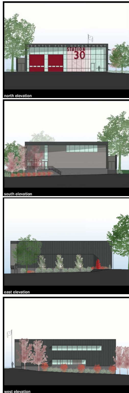
Figure 5: Fire Station 30 Elevations

Because there is no formal landscape plan for Mt. Baker Boulevard the team is meeting with Friends of Olmsted. There is currently a lack of trees in front of the station, which may be due to keeping the view corridor to Franklin HS clear. This has provided an opportunity for the art to be located in the Mt Baker Blvd ROW. The location across the sidewalk creates a natural gateway, expanding the civic environment.