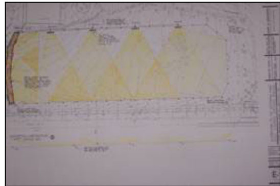
Jefferson Park Conceptual Lighting Plan

The proponents have held meetings with the community. The community's main concern is the lighting, which shines into the community center and into neighbors' windows, so designers are addressing that.