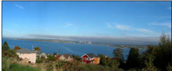
View of Lake Washington from 32 nd Avenue South

The applicant is co-petitioning with an adjacent property owner, but can speak for both parties today. He presented both owners' plans for their properties. They would like the city to grant them a partial street vacation (and thereby ownership) for a segment of land that extends from their property lines to the edge of the stairway, which is located in the middle of an unopened public right-of-way. The additional property would enable them to: 1) develop a more generous residential parcel with a single family house and 2) subdivide the second property and build two single family houses on that. He will leave the existing stairs and build a new viewing platform, which he will deed back to the city. The city will not only gain a viewing platform for the public to use, it will also gain immediate funds from the sale of the property, perpetual extra tax revenue from development of an additional residence on the property, and an additional single-family residence.