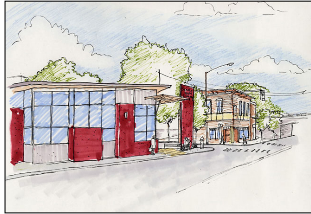
View from Cloverdale

The building plan has been further refined. It now includes: