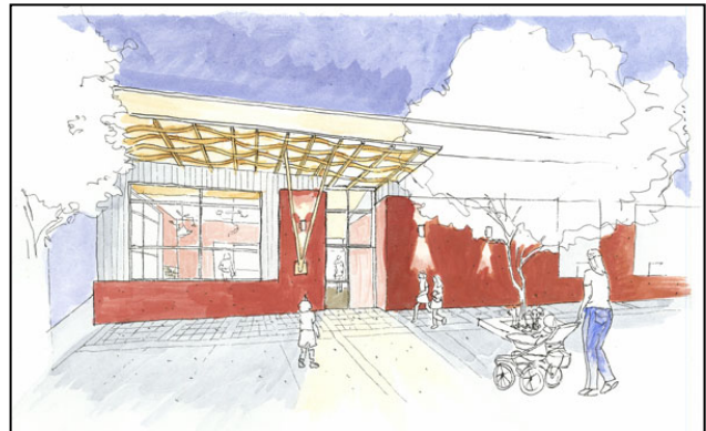
South Park Library Sketch

The proponents would specifically like the Commission’s reaction to the new courtyard design and use of gobos to project art.