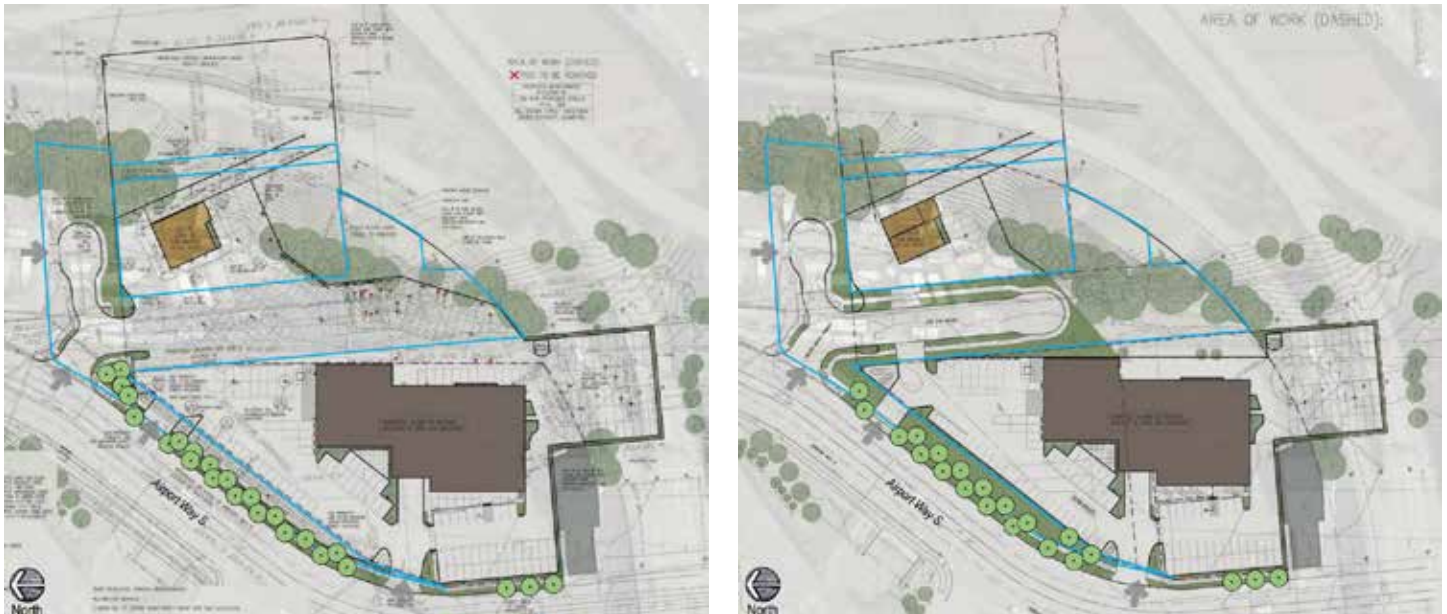
Figure 3: Proposed vacation (left) and no vacation (right) scenarios

proposes removing 17 trees from the existing public rights-of-way. Additionally, site plans with vacation granted show green space removed along Airport Way South and South Hinds Street. The proposed design under the no vacation alternative include the main dealership facility, surface parking, surface storage, and ROW improvements along S Hinds St and 9th Ave S. See figure 3 for more detail.