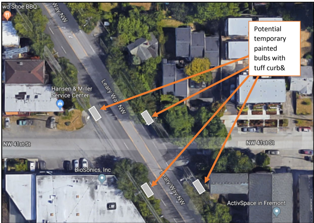
Figure 2: Proposed Improvement, NW 41 ST Street & Leary Way NW