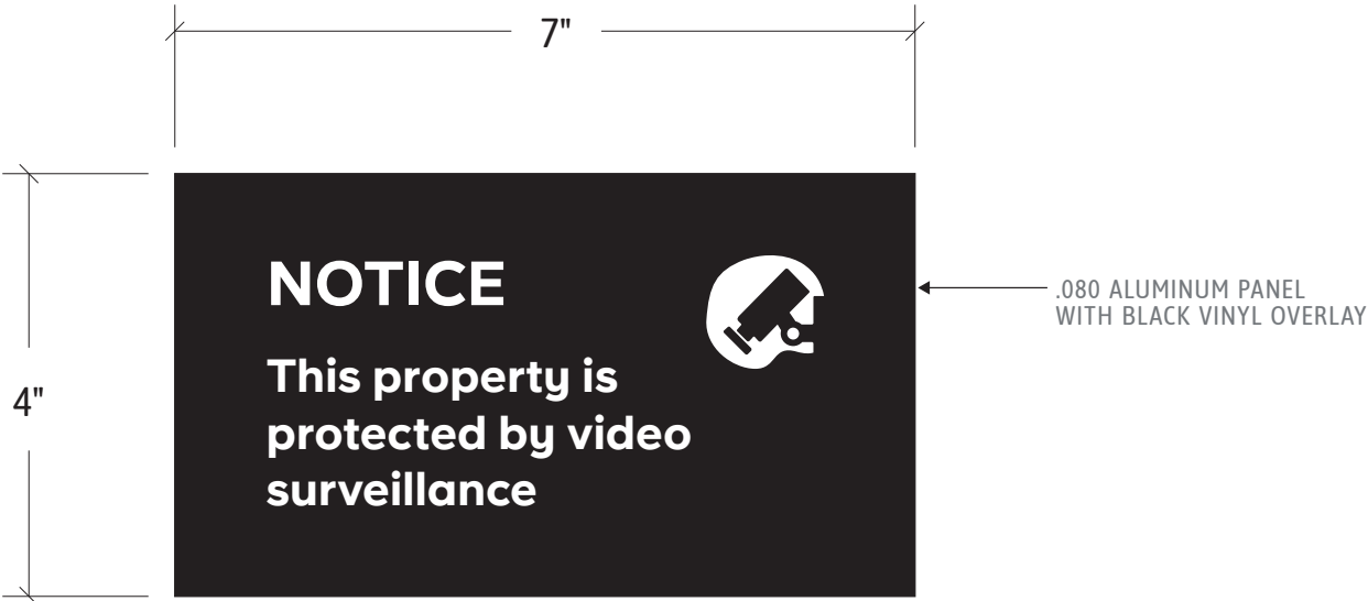
FRONT SCALE: 6"= 1'

FASTENERS MUST BE LOCATED ONLY IN MORTAR JOINTS FOR ALL MASONRY. NO ATTACHMENTS MAY BE MADE THROUGH BRICK, STONE, OR TERRA COTTA.