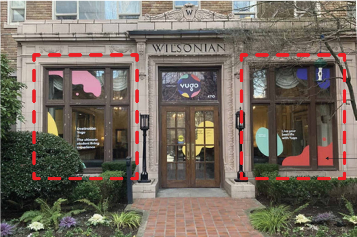
EXISTING WINDOW GRAPHICS TO BE PERMANENTLY REMOVED (DO NOT TO REPLACE OR INSTALL NEW)