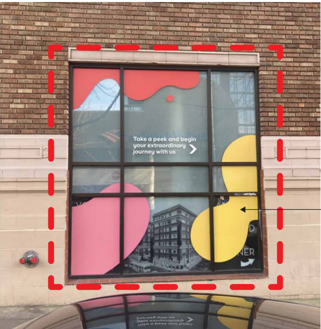
EXISTING WINDOW GRAPHICS TO BE PERMANENTLY REMOVED (DO NOT TO REPLACE OR INSTALL NEW)