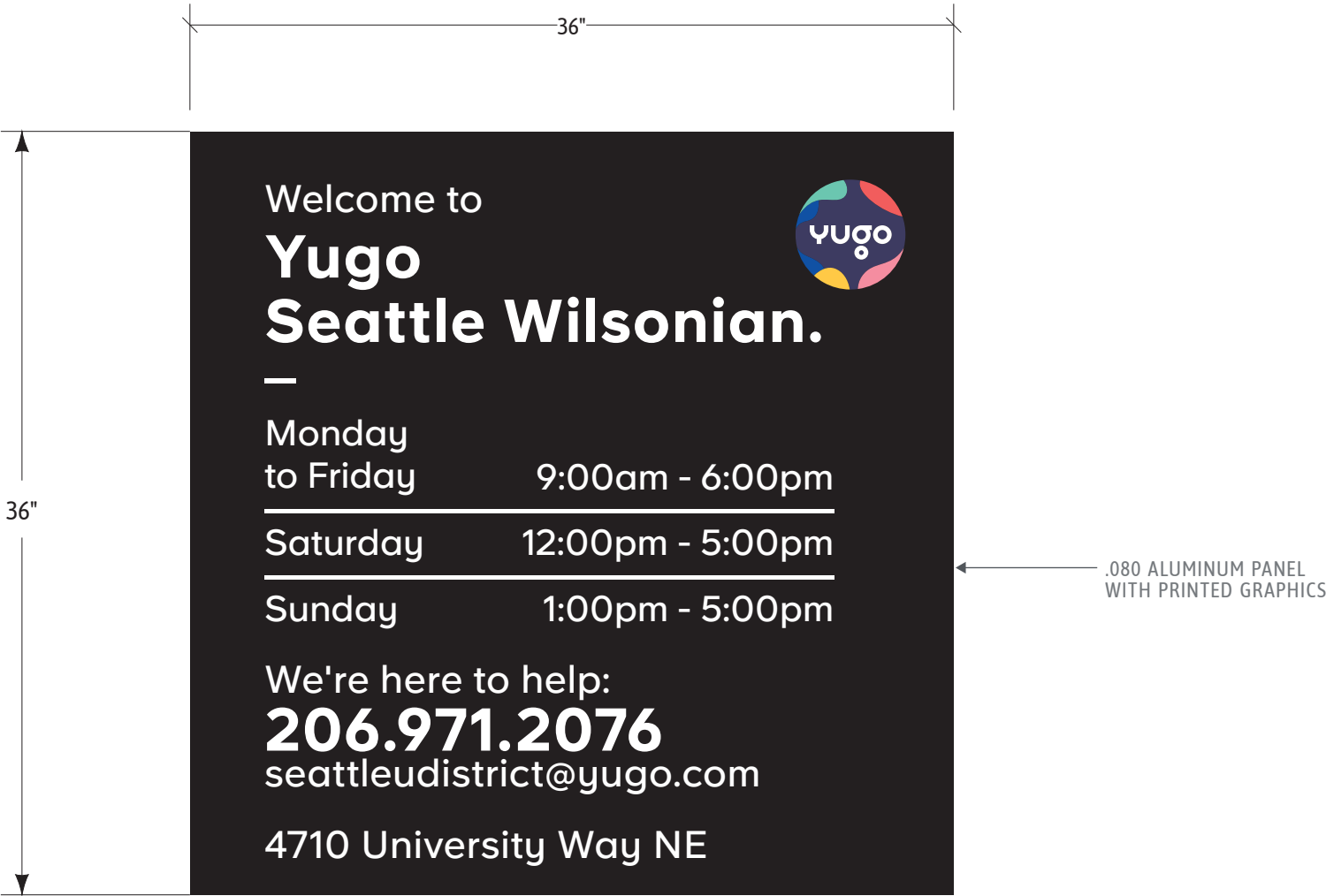
FRONT SCALE: 1 1/2" = 1'