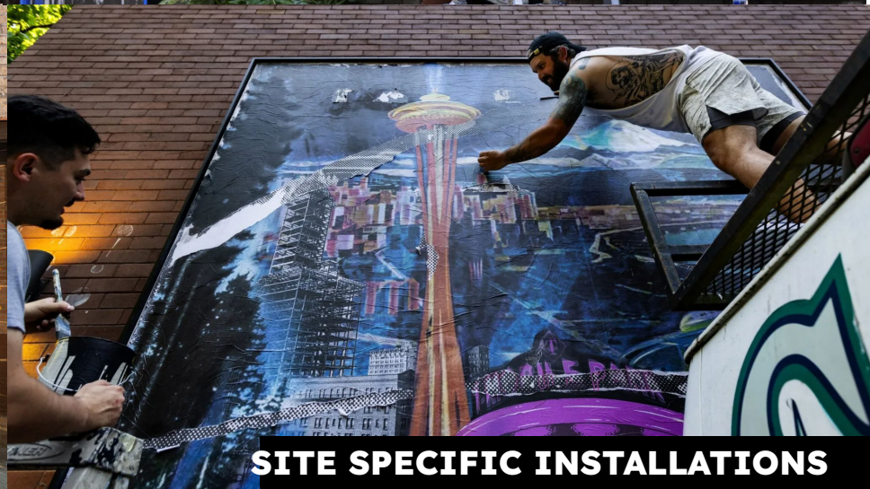
SITE SPECIFIC INSTALLATIONS